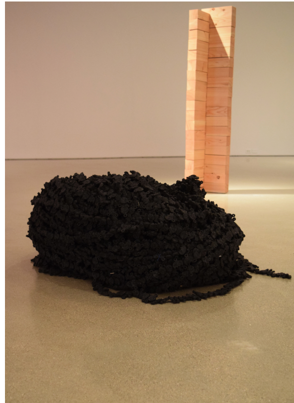
Mend on Wednesday: Gathering 4,225 Chains. Boot liner, cotton yarn. 2018