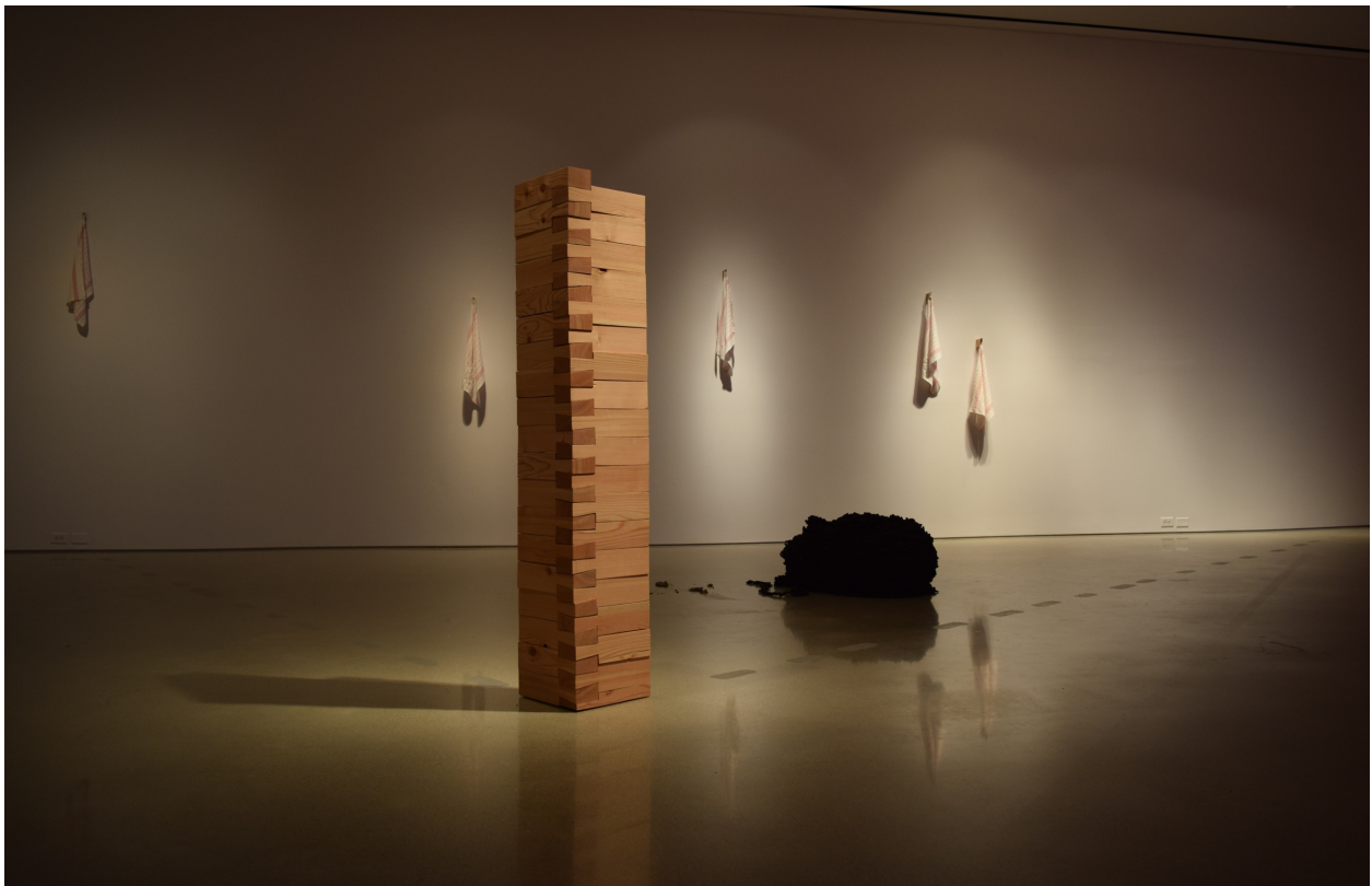
La-Petite-Pointe-de-Sapin. Fir. 2017