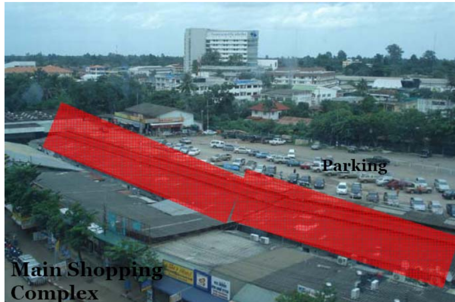
Figure 6: This photo is taken from the fourth storey of the main shopping complex. The main group of expat bars (Soi Pattaya) is located under the red shading. Though Soi Pattaya is not directly visible from the street anyone using the main shopping complexes auxiliary parking lot will walk through the bars.

Around half of this group of bars is managed by expats while the other half is Thai managed.