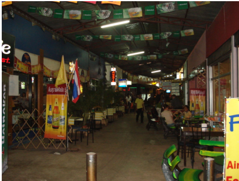
Figure 3: Soi Pattaya is a group of 13 bars located in the center of Udon Thani.

The group of bars is unintentionally hidden from the view of the main roads and is found through a series of alleys. The bars are housed in an old market which is in the process of redevelopment with several sections getting torn down over the past few years to provide parking for the main shopping centre. There is consistent talk about the future of these bars as the land is slated for development.