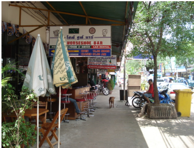
Figure 7: Foreigner bars are located throughout town and are clustering in small groups.

There is a clustering of a few bars on Prajak Road, many of these bars follow the same formula with a combination of Thai and western food, bar girls, cheap drinks, music and occasionally a pool table.