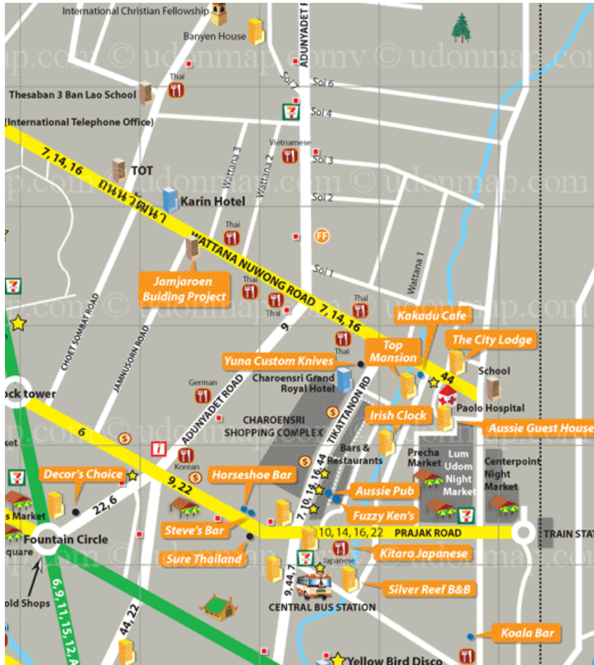
Figure 5: This tourist and expat map gives an idea of the location and scale of the hotels and expat bars located in central Udon Thani.