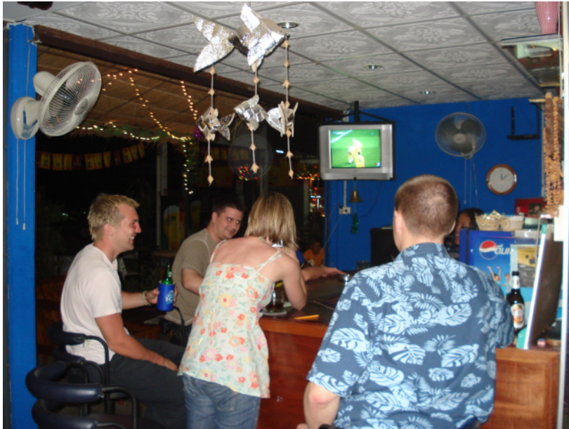
Figure 4: A standard Udon Thani bar. The younger clientele is not representative as older men are the typical clientele.