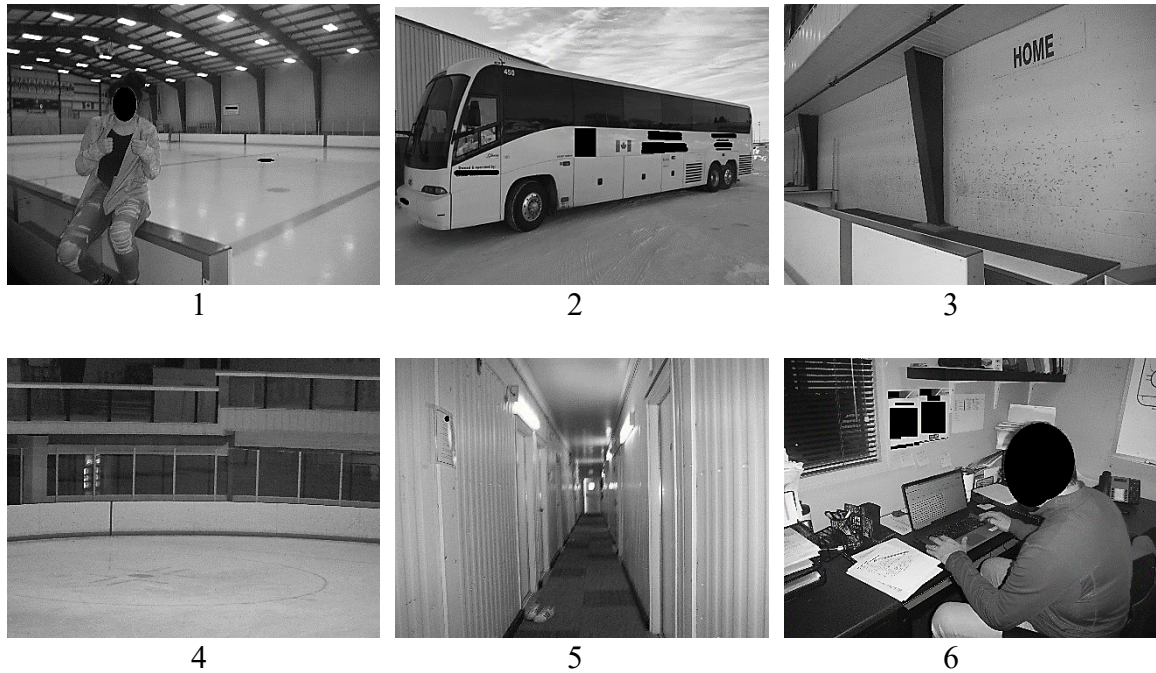
Figure 3. Sample of photographs used in interviews depicting the theme Network of Social Support. All photographs were taken by participants. Names, words and other identifying features have been blacked out by the lead researcher to protect the identities of individuals and programs.