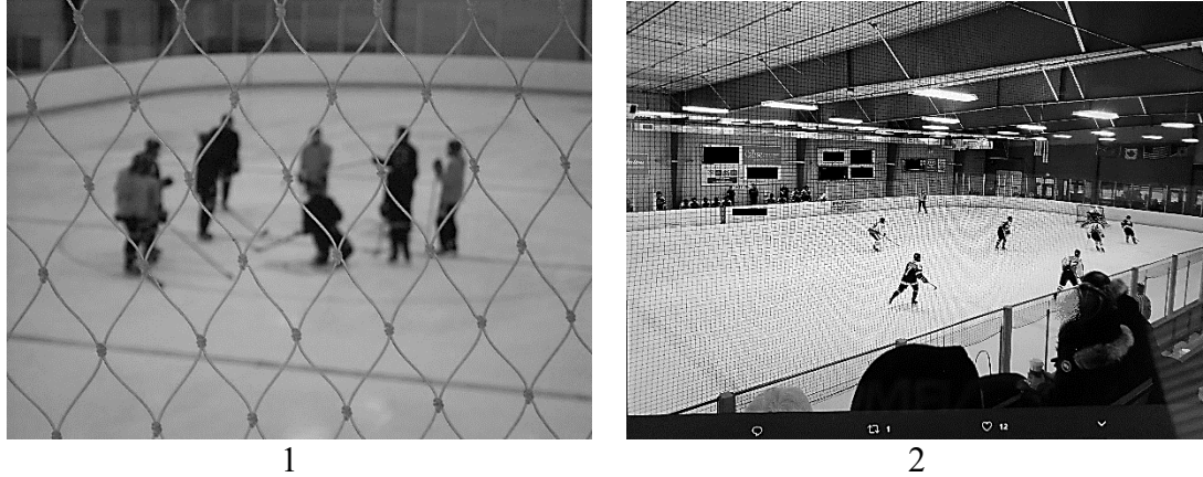
Figure 1. Sample of Photographs Used by the Lead Researcher in Interviews

Figure 1. Photograph of a team practice taken by the lead in person (a) and a photograph of competition taken from social media (b) for use in interviews. Photographs chosen by the lead researcher were used in interviews and intended to account for photographs of meaningful aspects of the program which would not otherwise have been captured by participants due to lack of opportunity. Names, words and other identifying features have been blacked out by the lead researcher to protect the identities of individuals and programs.