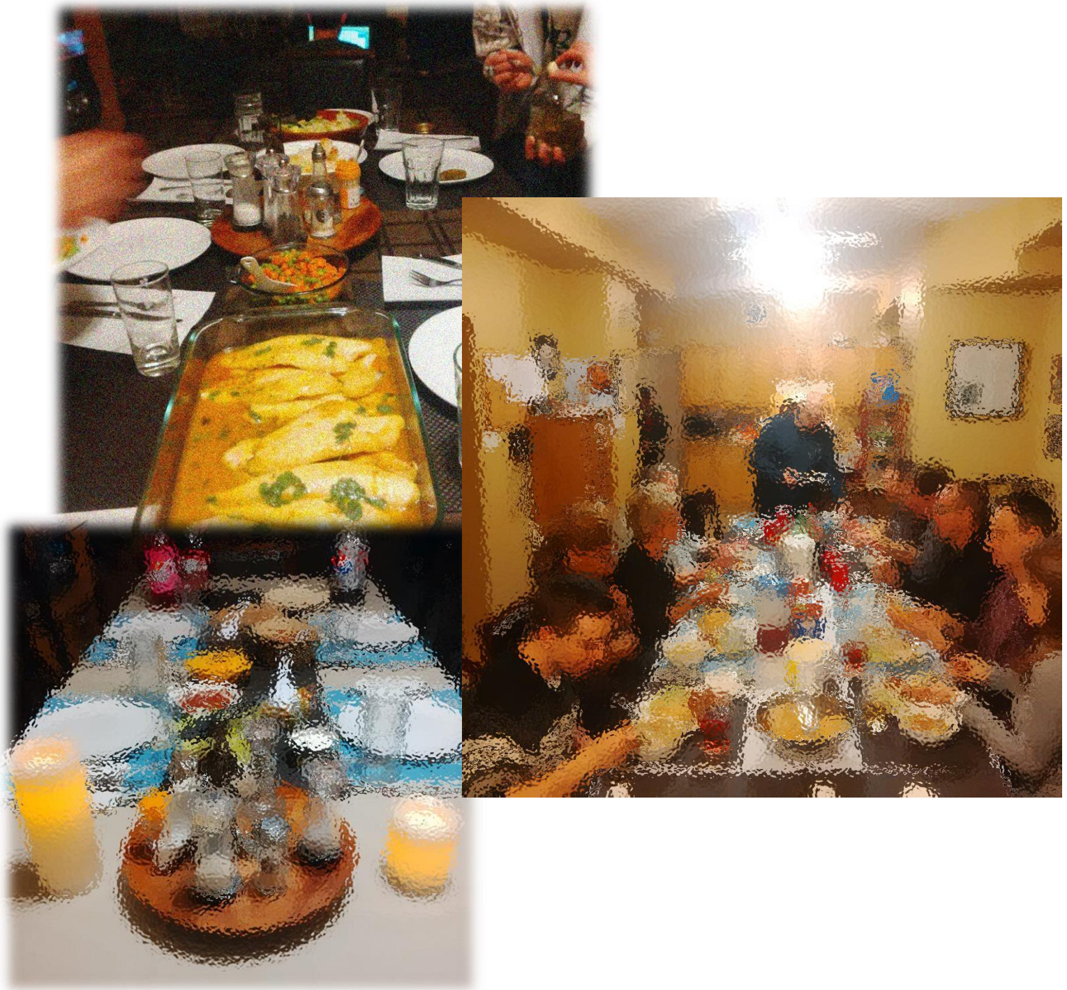
Illustration 1: Indoor photos of Quixote House