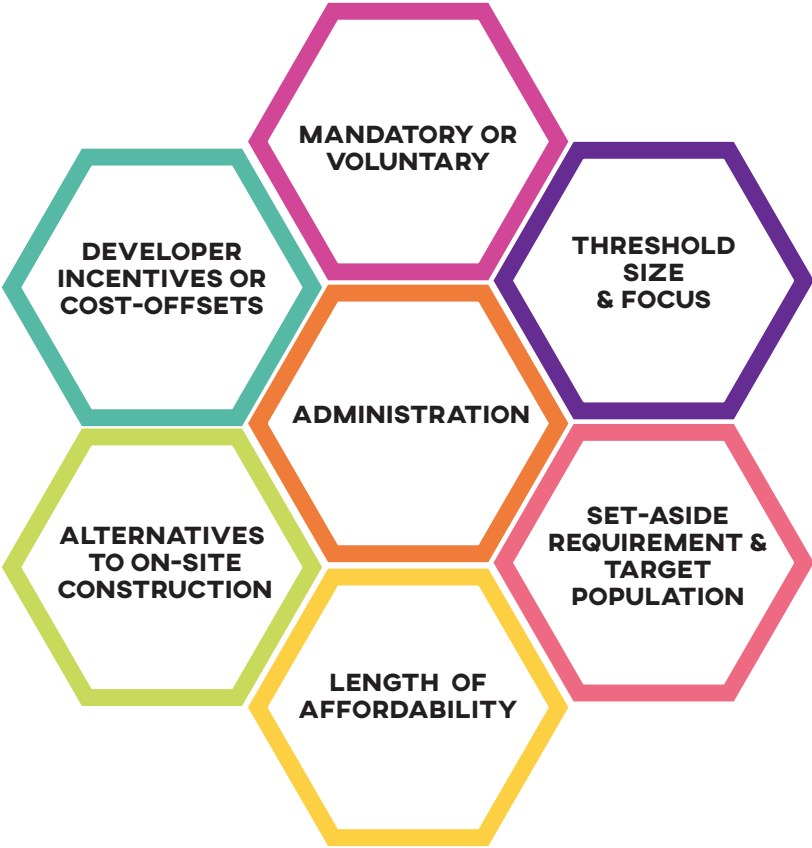
Figure II: Considerations for Policy Design

IZ is enacted differently in each location, speaking both to its ability to respond to unique local needs, but also the complicated nature of implementation. There are a number of key aspects to consider, and the success of a program relies on these key points. These aspects of policy design are shown in Figure II, visualized in a honeycomb shape pointing to interrelated nature of each aspect of the policy.