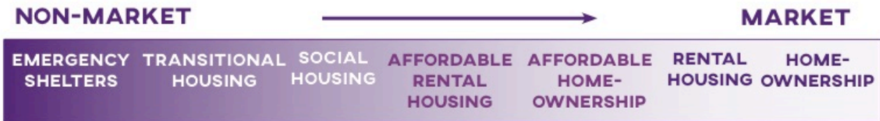
Figure I: Housing Continuum

While the housing continuum is useful for showing the range of housing supports available to be provided by a public actor, it is challenging in that it positions home-ownership as the ultimate goal. It also posits that one can, and should, transition in a linear line from relying on non-market housing supports into independent homeownership in the private market. In reality, living in any form of housing, as long as it fits one’s needs and lifestyle can, and should, be the housing goals we work towards. While homeownership might be the goal for some, living in social housing or cooperative housing for one’s lifetime is an equally valuable goal. In this vein, when cities and other levels of government consider housing policy, the goals should be to support an individual’s or family’s desires and needs, not to help one transition from non-market into private homeownership. Policy responses must explore a range of supports along the housing continuum.