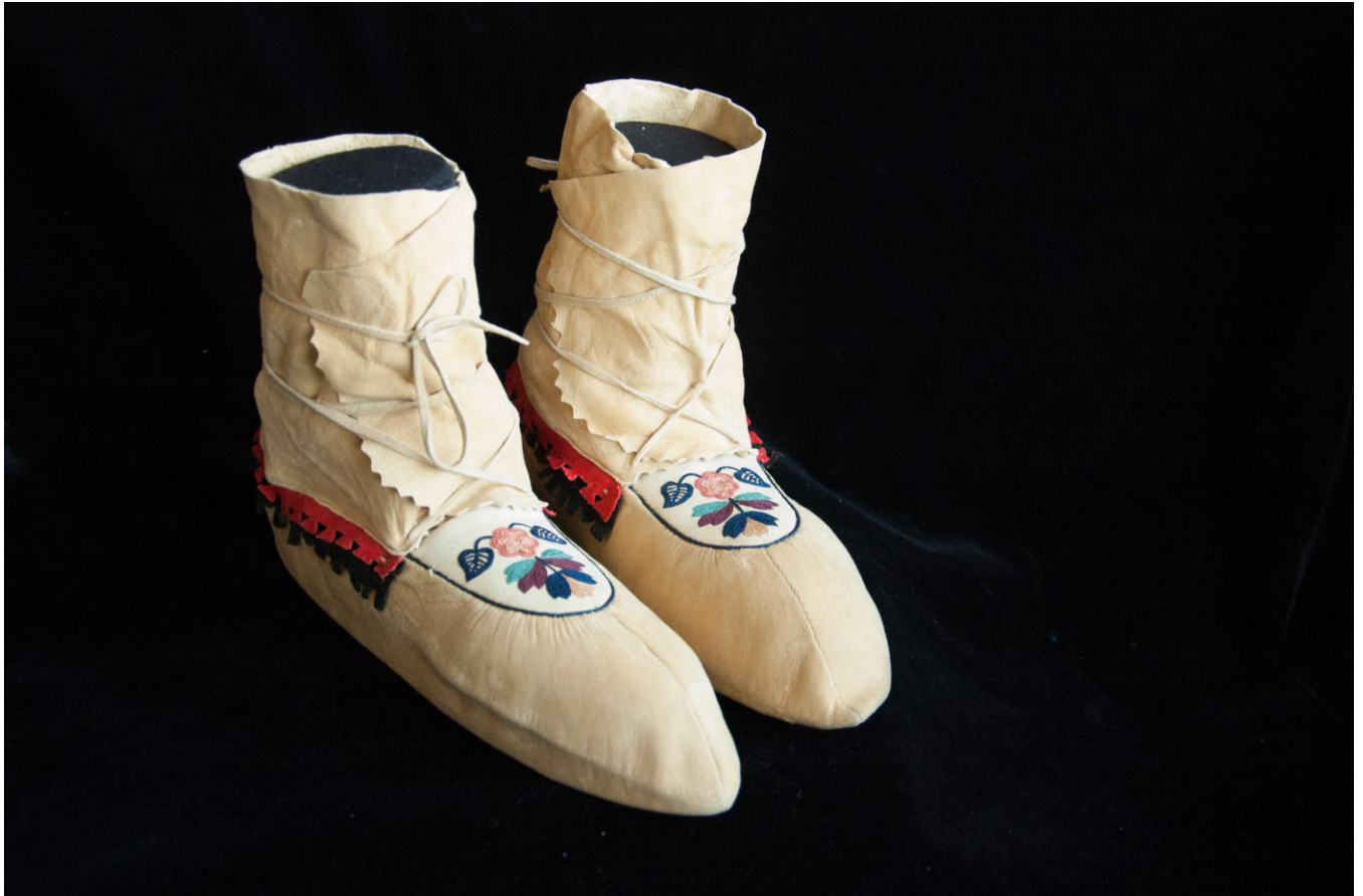
Figure 4.4 – Moccasins beaded in the Davis School style of beadwork, H4-0-772-2061, Manitoba Museum

executing needle-work, however coarse, under the inspection of a master, who cannot be supposed to give proper instruction in such matters, and who is moreover an unmarried man.” 140