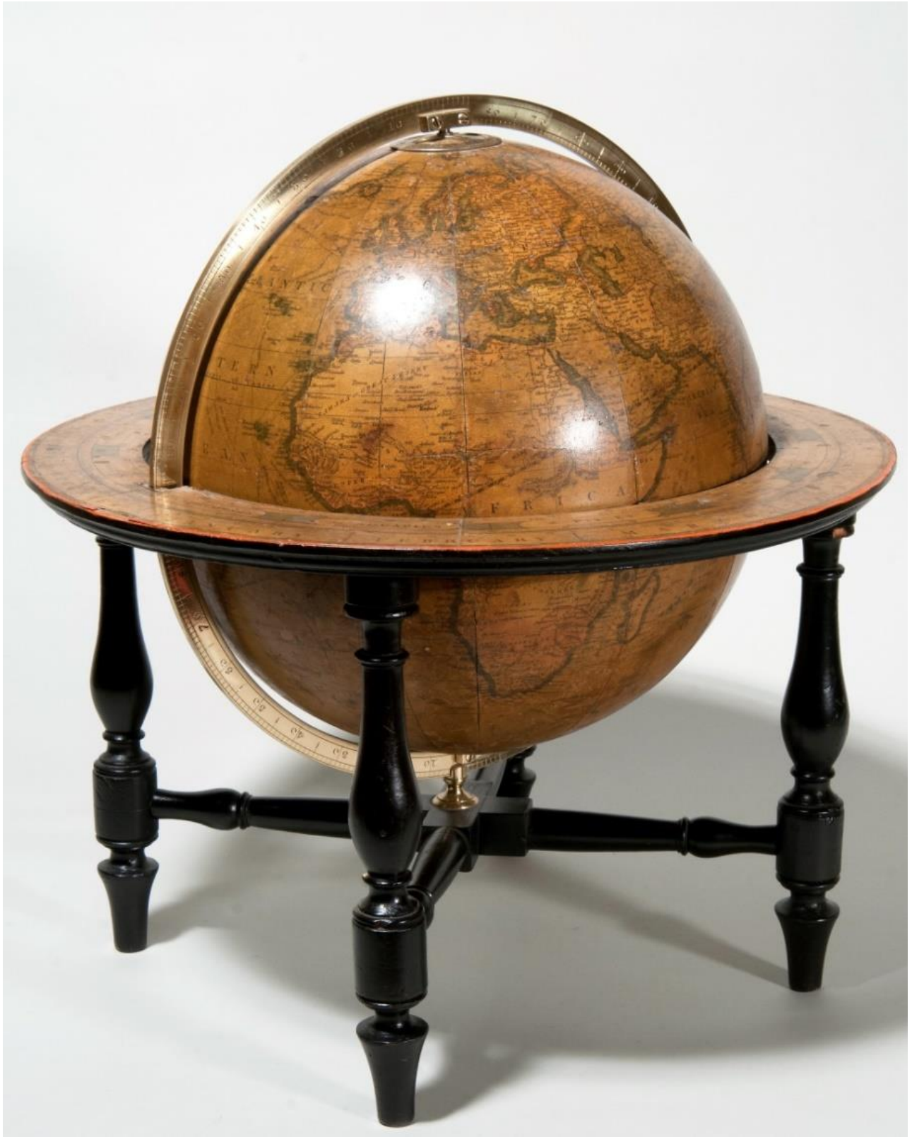
Figure 4.3 - Globe from the Miss Davis School, Manitoba Museum, HBC 49-1 (A)