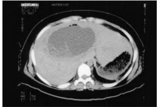
Figure 2) After two weeks of percutaneous drainage, the cyst had decreased in size. A daughter cyst and the endocyst wall were noted in the dependent portion of the cyst. The cyst measured approximately 8 cm in diameter

one patient had cysts in both the lungs and liver, and two patients (12%) had cysts in the spleen. The diagnosis was confirmed pathologically or with a combination of positive serology and characteristic appearance on imaging studies. Twelve patients (71%) were treated with surgery alone, two patients (12%) were treated with surgery and percutaneous drainage, and three patients (18%) received no curative treatment. One of the no treatment patients suffered spontaneous rupture of a hepatic hydatid cyst and was treated with paracentesis, which led to complete recovery. The other two patients were lost to follow-up. Eight patients received oral albendazole in addition to surgical treatment.