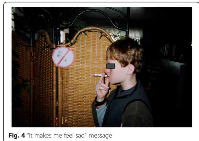
Fig. 4 "It makes me feel sad" message

Although recognizing that smoking was a personal choice, youth felt it was important to support youth who smoke by not blaming or judging them.