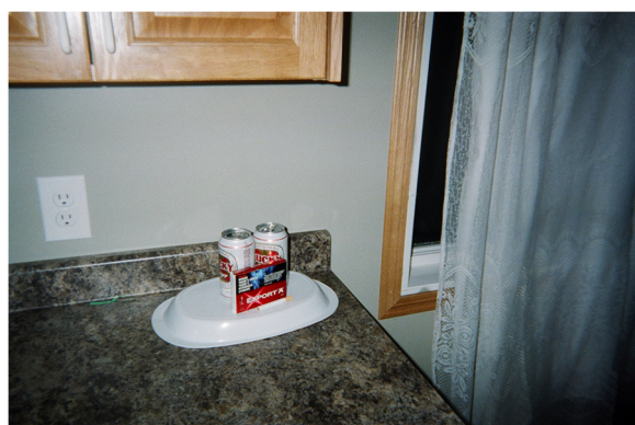
Fig. 5 "Taking responsibility for smoking" message

It's their choice to smoke and if they want to...and I'm not going to judge them based on what they choose to do because I wouldn't want them to judge me based on what I choose to do. [17-year-old female]