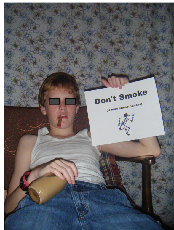
Fig. 2 “It is up to you” message

Interviewer: Okay. So what can you tell me about those posters?