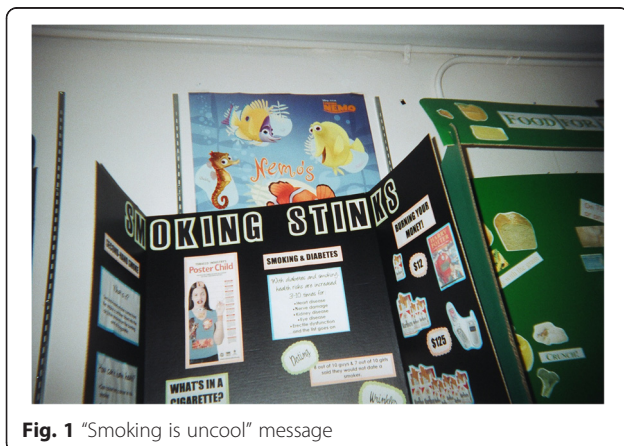
Fig. 1 “Smoking is uncool” message

One youth indicated that smokers at his school were branded as the smoker kids ; and considered as not fitting in to the school culture. Children who smoked were ostracized and seen as youth who got into trouble.