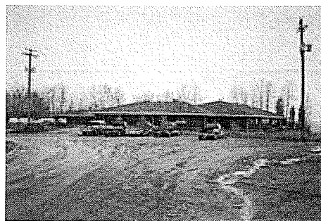
Illustration 2: Oxford House Nursing Station, April 2008

The vast difference between health services available in Gimli and Oxford House demonstrates the unbalanced nature of health care services in Manitoba. Unfortunately, limited access to medical services contributes to the poor health of Aboriginal people. Aboriginal people may delay necessary medical treatments because they do not wish to leave their communities. Serious operations and treatments require reserve Aboriginals to