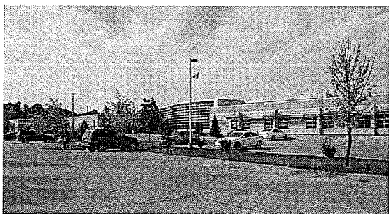
Illustration 1: Gimli Hospital, September 2008

Emergency / Out Patient Department, Diagnostic Imaging and Lab Services, Chemotherapy Program, EMS / Ambulance, Palliative Care, Acute Care, Physiotherapy Services, Occupational Therapy Services, Adult Day Program and Pharmacy Services 85 . The Gimli Community Health Office provides a full range of health services including public health, mental health and home care to all residents within the community. Gimli also has two dentists, an optometry clinic, a dentist, a clinic offering physiotherapy and massage, a veterinarian and two drug stores 86 . Gimli offers a Handi-Van service and a meals-on wheels program, to help the elderly and infirm. The hospital even has a “Healing Garden” with a fountain, fire-pits and seating areas, aimed at providing a stress-free place of healing for those in care at the centre and those in the community.