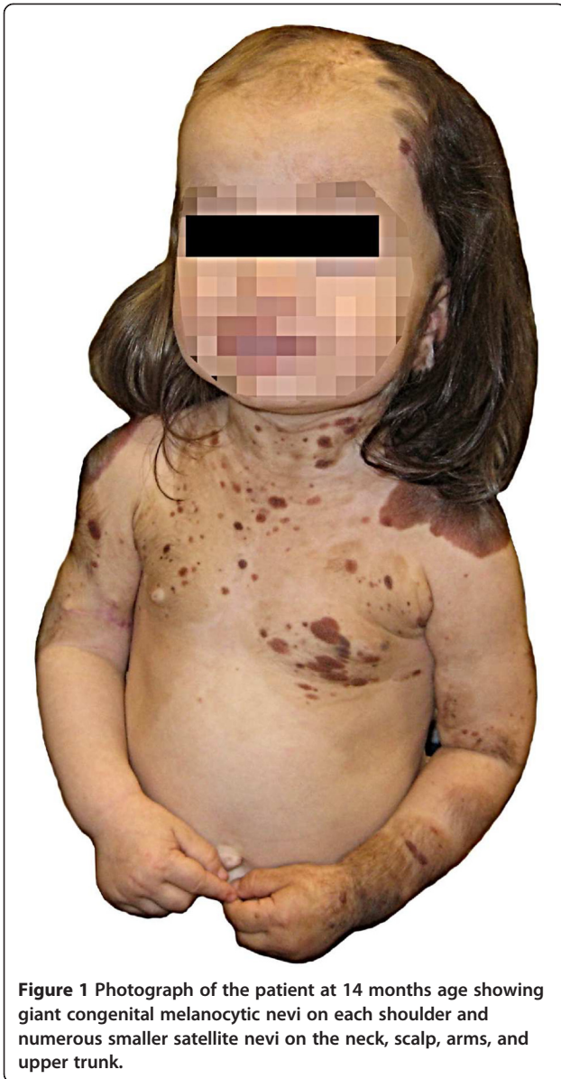
Figure 1 Photograph of the patient at 14 months age showing giant congenital melanocytic nevi on each shoulder and numerous smaller satellite nevi on the neck, scalp, arms, and upper trunk.

with signal characteristics the same as cerebrospinal fluid (CSF) were present around the atria of the lateral ventricles in the right cerebellopontine cistern along with small cysts around the bodies of the lateral ventricles. The left cerebral hemisphere was larger than the right, and parietal white matter volume was abnormally small. The combination of giant congenital nevi along with cerebral melanin deposition led to a clinical diagnosis of NCMS [10]. A CT scan of the head performed at 4 months age during an episode of status epilepticus showed no additional abnormalities. An abdominal sonogram performed the following day showed no abnormalities. Repeat MR imaging showed the presumed melanocytic nodule had increased to 3 mm; it was hyperintense on T1, hypointense on T2, and hyperintense