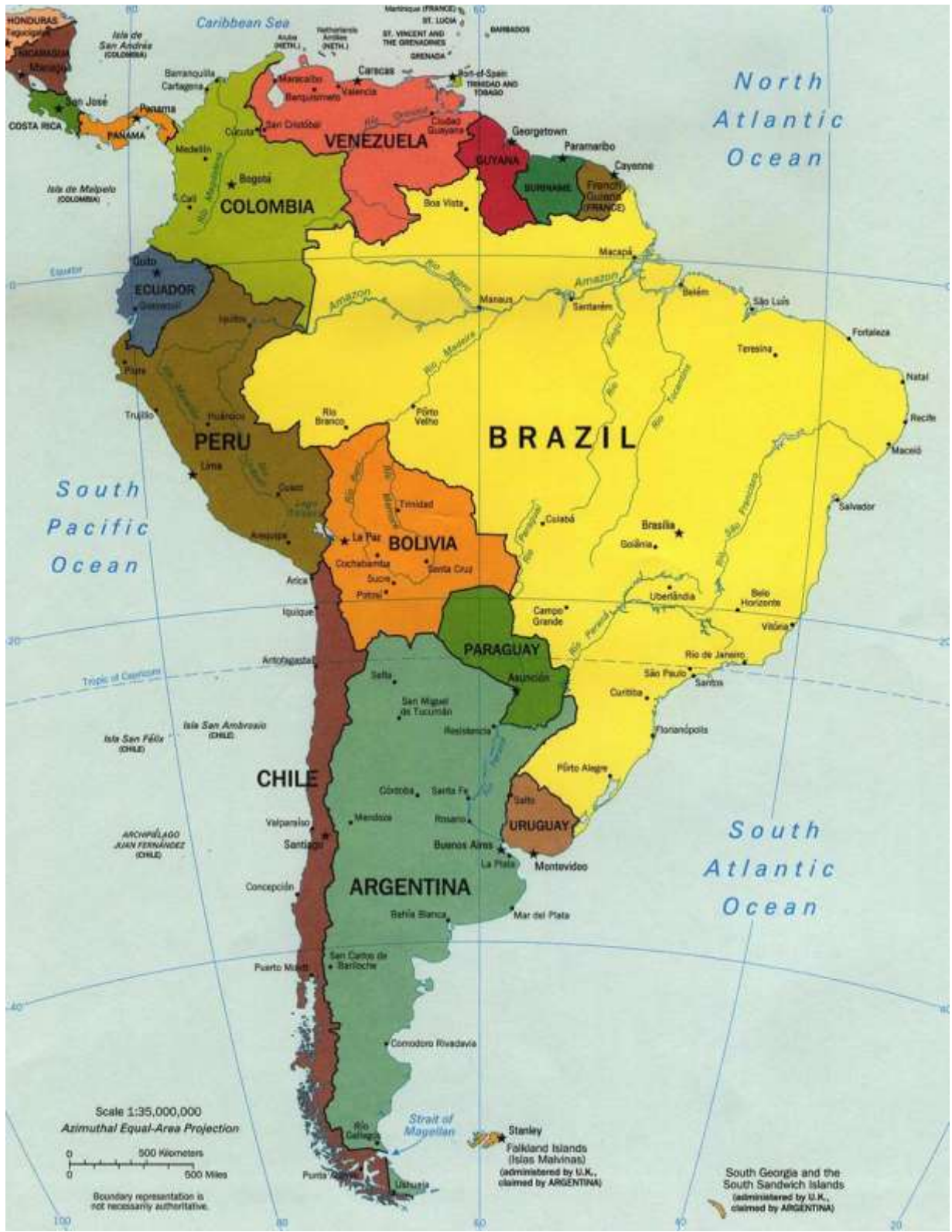
Figure 1.3 – Map of South America