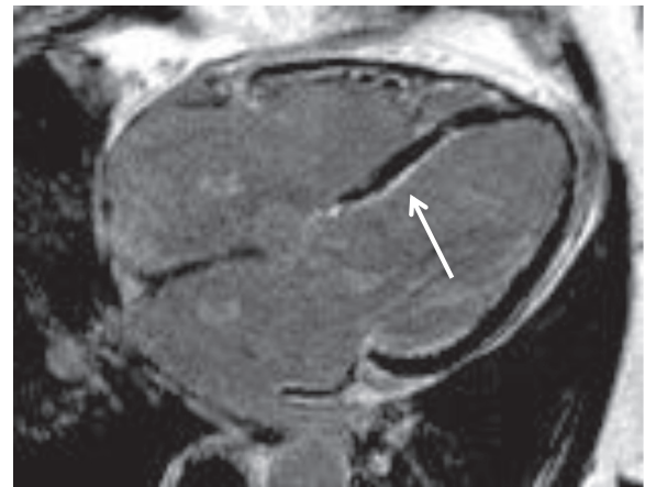
Figure 2 Magnetic resonance imaging with arrow depicting subendocardial delayed enhancement in the 4 chamber axial view.

infection and stool for ova and parasites as well as serology for trypanosome and strongyloides were negative. A vasculitis screen including anti-neutrophil cytoplasmic antibodies (ANCA) was negative. There were no recently started medications to suggest a drug induced hypersensitivity reactions and physical exam and history were negative for malignancy.