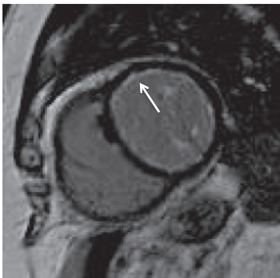
Figure 1 Magnetic resonance imaging with arrow depicting circumferential subendocardial delayed enhancement on the short axis view.

A 76-year-old Caucasian gentleman with a history of hypertension and asthma presents with history of sharp and pleuritic chest pain radiating to the shoulders with associated dyspnea with gradual deterioration of functional status to New York heart Association (NYHA) functional class III. Laboratory investigations revealed a normal creatine kinase (CK), elevated troponin T at 2.74 ug/L, C-reactive protein (CRP) at 140 mg/L (normal: 0–8), and eosinophilia at 3.92 \times 10^5/L . The initial presumptive diagnosis was acute coronary syndrome however coronary angiography revealed no significant coronary artery disease. The patient was found to have global reduction in left ventricular systolic function, ejection fraction (EF) 30–35%, along with mildly impaired right ventricular dysfunction on echocardiography. In addition, an uninfused computed tomography (CT) scan of the chest revealed a small right pleural effusion and multiple small centrilobar nodules in the lungs bilaterally with upper lung zone predominance and ground glass attenuation consistent with pulmonary eosinophilia. Magnetic resonance imaging (MRI) identified mild subendocardial delayed enhancement with a near circumferential distribution raising the possibility of eosinophilic myocarditis (Figures 1, 2). There were no suggestions of underlying