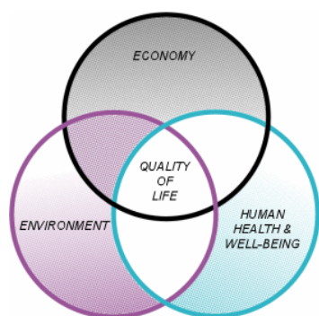
Figure 1.

Freire in the early 1960's, noted that "I have frequently witnessed how discussants grow in social awareness and how they are impelled to take political action as fast as they learn to read. They seem to take reality into their hands as they write it down" (p. 26-27). For transformation to emerge, we need to allow learners to see the world from their perspective and then take the