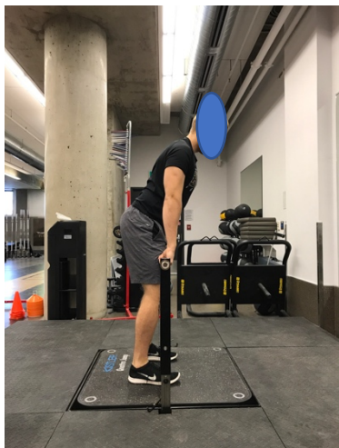
Figure 2B – Force plate IMTP demonstration.