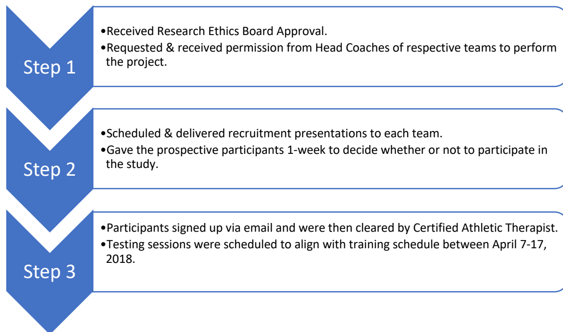
Figure 1 – Recruitment process flow chart.

provide written informed consent prior to participation. The study received ethical approval from the University of Manitoba Education/Nursing Research Ethics Board.