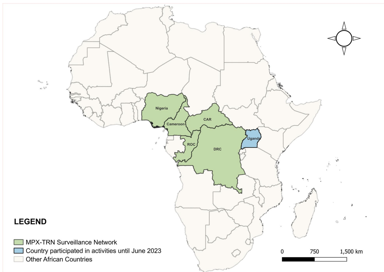
Fig. 1 Map of mpox regional surveillance network countries

funding opportunities for enhanced disease detection and research-focused grants. The regional surveillance network established and maintained WhatsApp channels to maintain real-time communication and share updates on publications and reports. These channels were not designed to serve as a replacement for the official channels, but to share real-time open-source information for rapid action. Beyond these channels, the network implemented additional bi-annual virtual meetings where participants could provide updates on trends, changes in surveillance, and ongoing research studies.