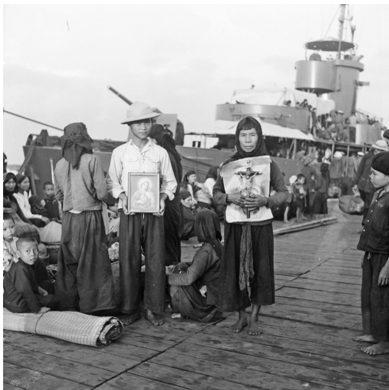
Figure 3.2 Refugees disembark the French boat, La Pertuisane , in Haiphong and wait to be transported to Southern Vietnam, circa October 1954; photo by Établissement de communication et de production audiovisuelle de la Défense, https://www.ecpad.fr/presse/ (©René Adrien/ECPAD/Défense/NVN 54-158 R2).

expansion. This shows that humanitarian mobilization can serve political interests and that refugees are not only victims of persecution. They are also proactive actors seeking recognition and becoming the spokespersons of a common front (Figure 3.2).