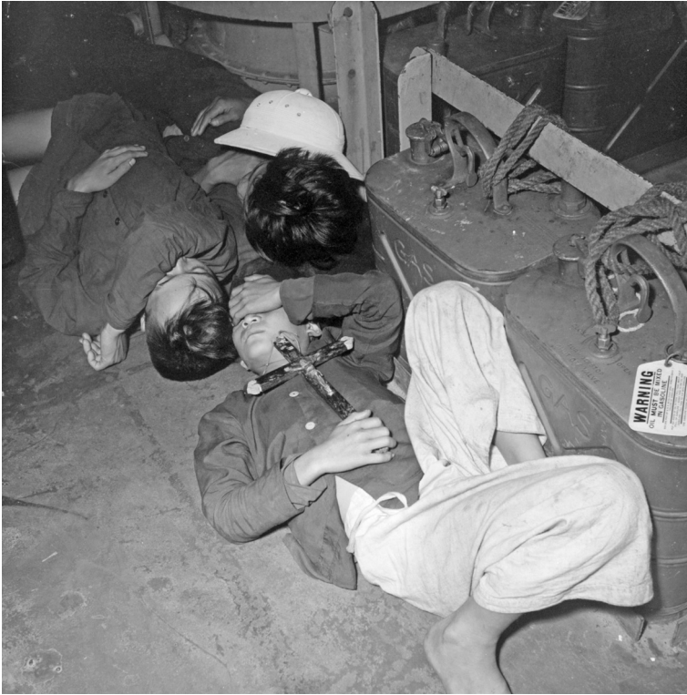
Figure 3.1 A young man lies down on the deck of a boat transporting him from Phat Diem to the regrouping point in Hai Phong, circa October 1954; photo by Établissement de communication et de production audiovisuelle de la Défense, https://www.ecpad.fr/presse/ (©Jean Lussan/ECPAD/Défense/NVN 54-166 R6).

Most studies have focused on the resettlement of these refugees (Hansen 2008, 2009b; Picard 2016). Instead, this chapter analyzes the relationship between their religion and refugee protection. It shows that refugee protection is best understood as a relationship that is intentional, dynamic, and dialectical. Catholic charity extended its support to other coreligionists across the globe because they considered they are part of the same family. But the dispatch of Catholic emergency relief overseas was neither automatic nor universal. The 1954 refugee crisis shows that missionaries and high members of the hierarchy, often former refugees themselves, channeled international Catholic aid into Vietnam for both religious and political reasons. This network did not appear in 1954, but years earlier in China and Korea, under the Japanese occupation and the civil wars. Religious authorities and missionaries fleeing communist rule sought both protection and new partners in their ongoing struggle against