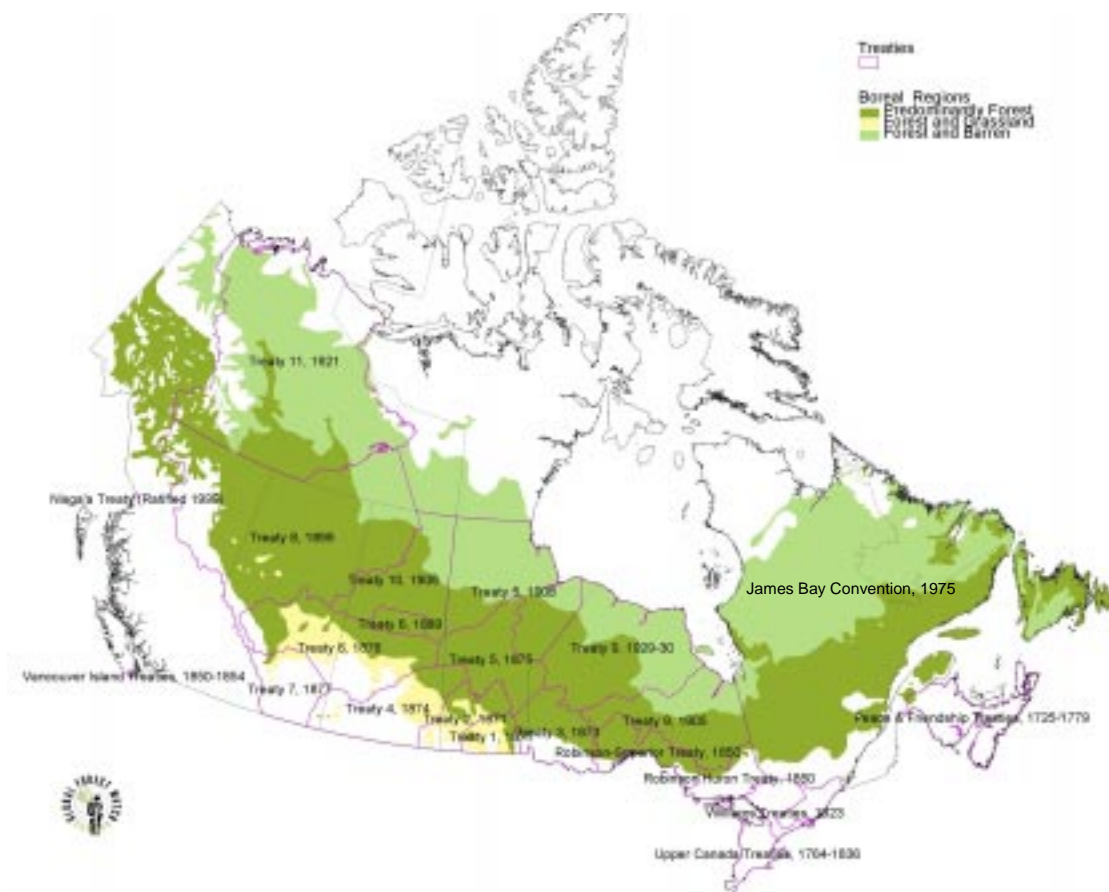
Figure 2 Treaty Areas with Indigenous Peoples in Canada.

Although much of Canada's boreal forest is now subject to commercial management for its wood products, it is relatively intact compared to most of Canada's (and the world's) other terrestrial biomes. The boreal forest still has large predators over most of its range in Canada – generally considered to be a sign of a healthy ecosystem. Yet, almost beyond debate, the most critical challenge facing Canada's boreal forest is the sustainability of the regimes and practices used to manage it. While techniques evolve to extract more wood more efficiently from the forest and the world's appetite for forest products grows, the pressures put on the boreal (and other forests) mount. New management paradigms attempt to reconcile growing industrial demands with growing sensitivity towards ecological considerations in attempts to bring balance to the manner in which forests are managed. The development of this standard is an attempt to help ensure that such a balance is achieved.