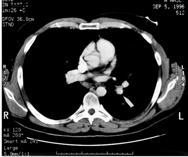
Figure 1) Infused computed tomography of the thorax showing an enhanced nodule superior to the right hilium suggestive of a mycotic aneurysm (top) and occluded lower lobar pulmonary arteries on the left side (bottom)

treated with intravenous cloxacillin and gentamicin for 25 days, followed by oral cloxacillin for two more weeks. An echocardiogram was not completed. Human immunodeficiency virus (HIV) and hepatitis serologies were negative.