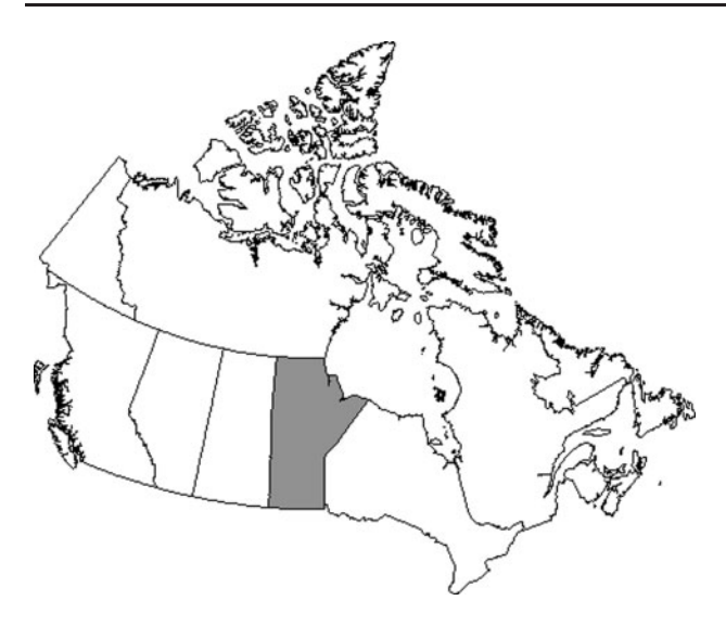
Figure 1. Province of Manitoba: the PATHS Data Resource includes population-based data on nearly every child born in Manitoba, 1984–2012<sup>40</sup>.

children such as prenatal exposures (e.g. alcohol, tobacco), parental anxiety disorders, parental education and criminal involvement. HCMO data also include the Early Development Instrument which assesses children's developmental status at kindergarten across five areas: (i) physical health, (ii) communication skills and knowledge, (iii) social competence, (iv) emotional maturity and (v) language and cognitive development.