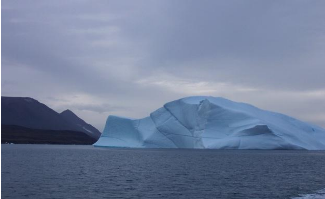
Plate 4.5: Massive Greenland Iceberg in Navy Board Inlet

I quickly realized that if an accident were to happen that we would be waiting for many hours for someone to reach us in such a remote location. The local joke is that the bright orange survival suits that we wore were not to keep you alive but instead so that rescuers would be able to spot your body. It is paramount that local people who are familiar with the currents and conditions are on board to help guide ships and prevent accidents. An elder commented on the fast currents around Bylot Island and how they would cause an oil spill to rapidly spread.