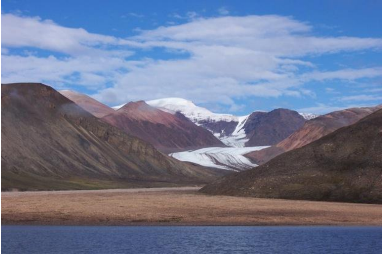
Plate 4.9: Bylot Island Near Navy Board Inlet

Many people who travel to Sirmilik National Park and the area around Pond Inlet do so at great expense in order to have a pristine “wilderness” experience. Many interviewees remarked upon the effect of shipping activities on this experience.