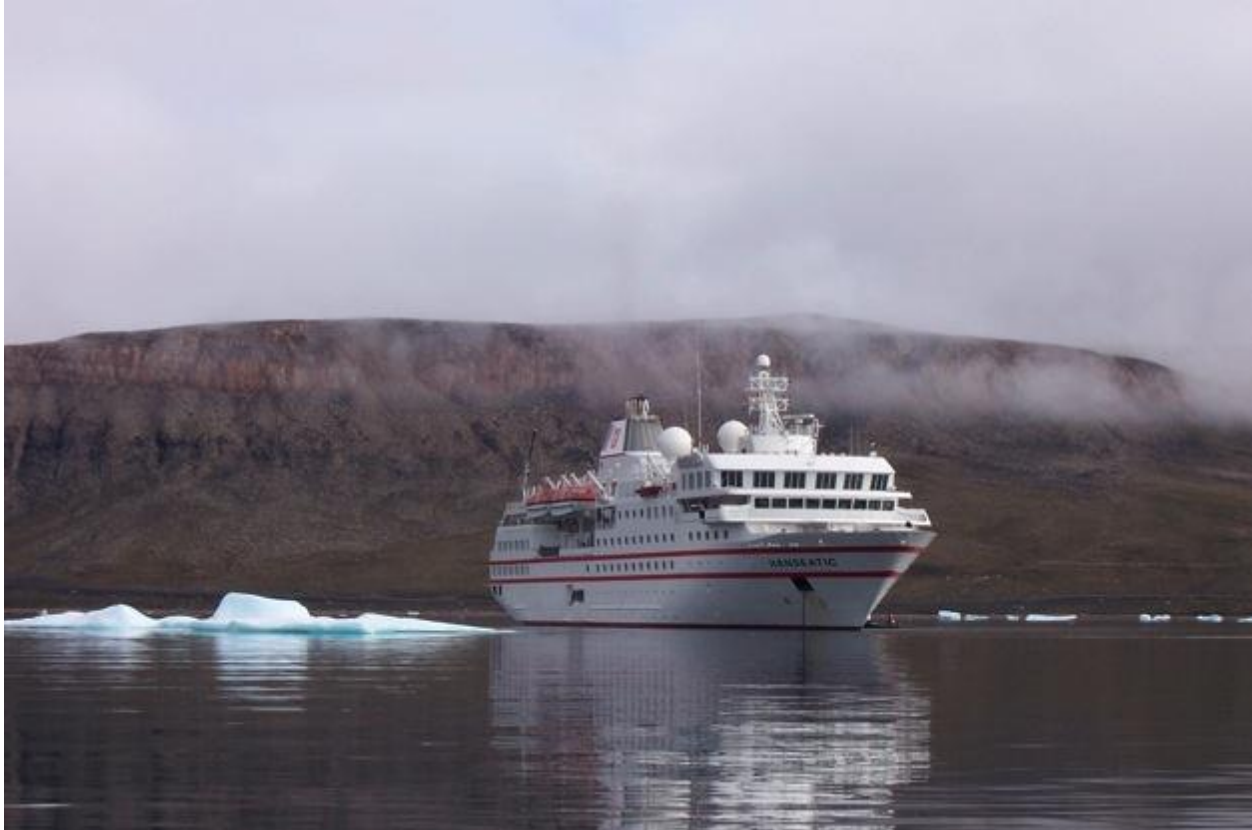
Plate 4.10: Hapag-Lloyd Hanseatic Cruise Ship Ferrying Passengers to Shore

Furthermore, if these areas are overwhelmed by increased visitation, the value and authenticity of the experience will diminish due to physical disturbance. One interviewee explained this as follows: