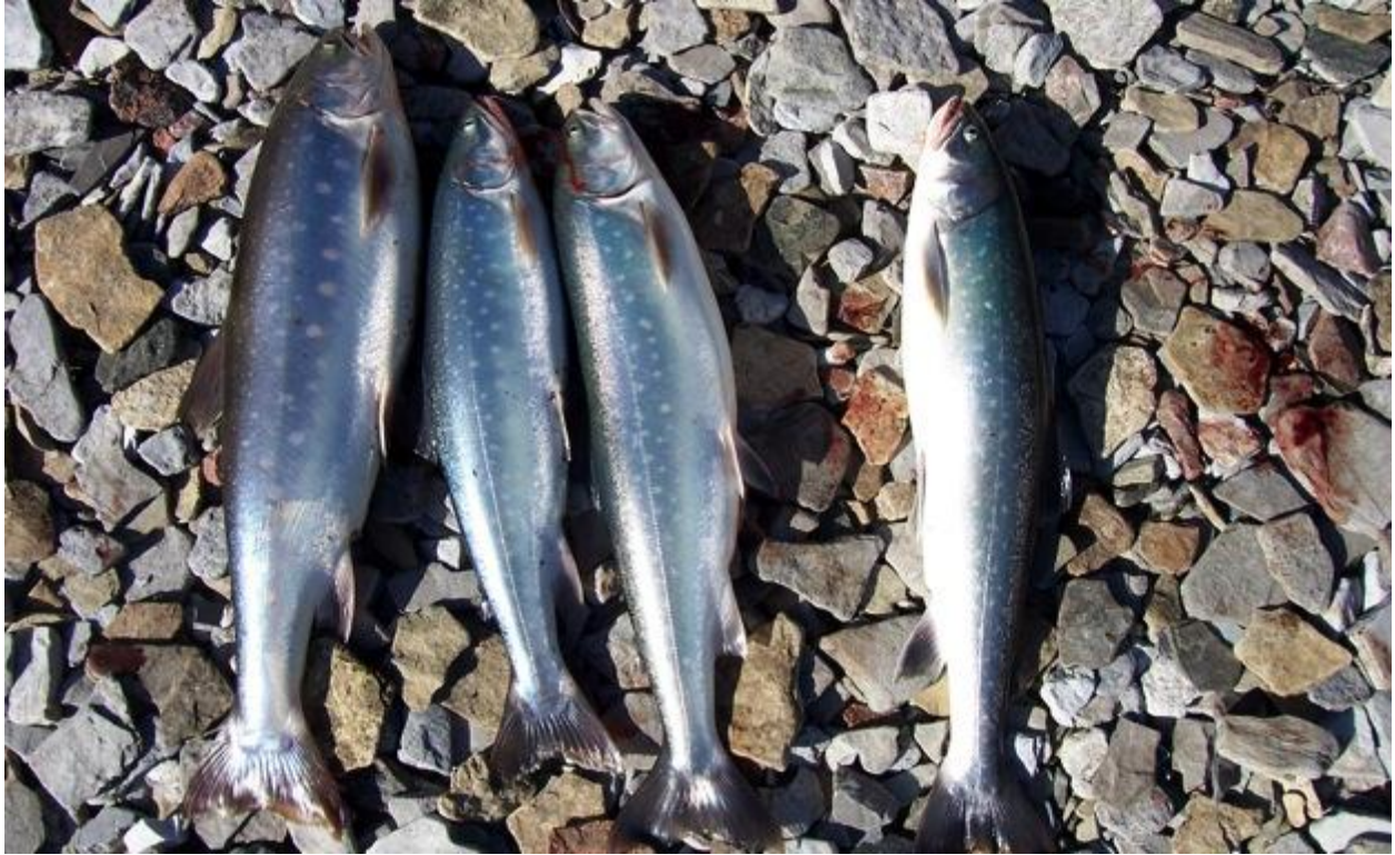
Plate 4.2: Four Fish Quota Filled Within an Hour

Toonoonik Sagoonik Outfitters offers fishing excursions to Koluktoo Bay, one of the top fishing sites in the world for catching arctic char. The most popular time for fishing is from just after the ice breaks up, right through to early September when they head back to the lakes. Because of their movement, they are sometimes hard to find. Subsequently, local people and outfitters are the best guides as to which areas contain the most char.