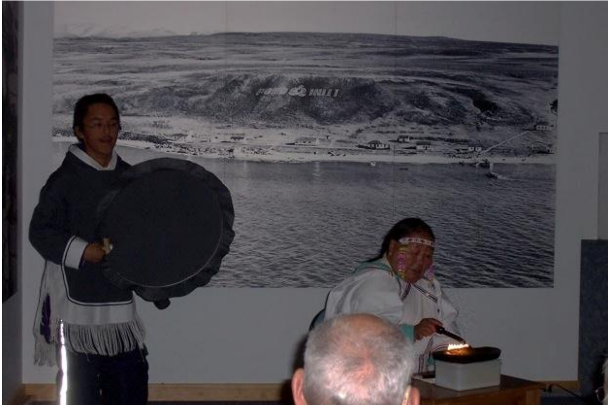
Plate 4.8: Cultural Demonstration for Tourists at Pond Inlet Cultural Centre

In order to mitigate these effects, respondents suggested that tourists need to be properly educated on local culture and provided with a cultural orientation prior to arriving. This will allow for the culture to be displayed in a positive manner rather than like a sideshow.