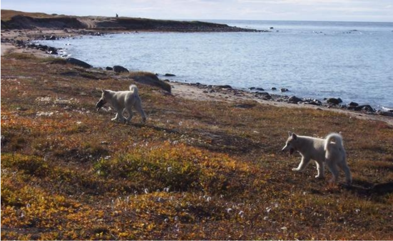
Plate 4.4: Shoreline Tundra Vegetation and Arctic Cotton

The plant species diversity of Bylot Island has been well documented since Lyngé (1947) and Hale (1954) and more recently it has been supplemented by field studies undertaken as part of the University of Laval Ecological Studies and Environmental Monitoring program (Drury (1962), Duclos (2002), McCormick et al. (1983)). In total more than 360 species of plants have been recorded for this area (Parks 2009a).