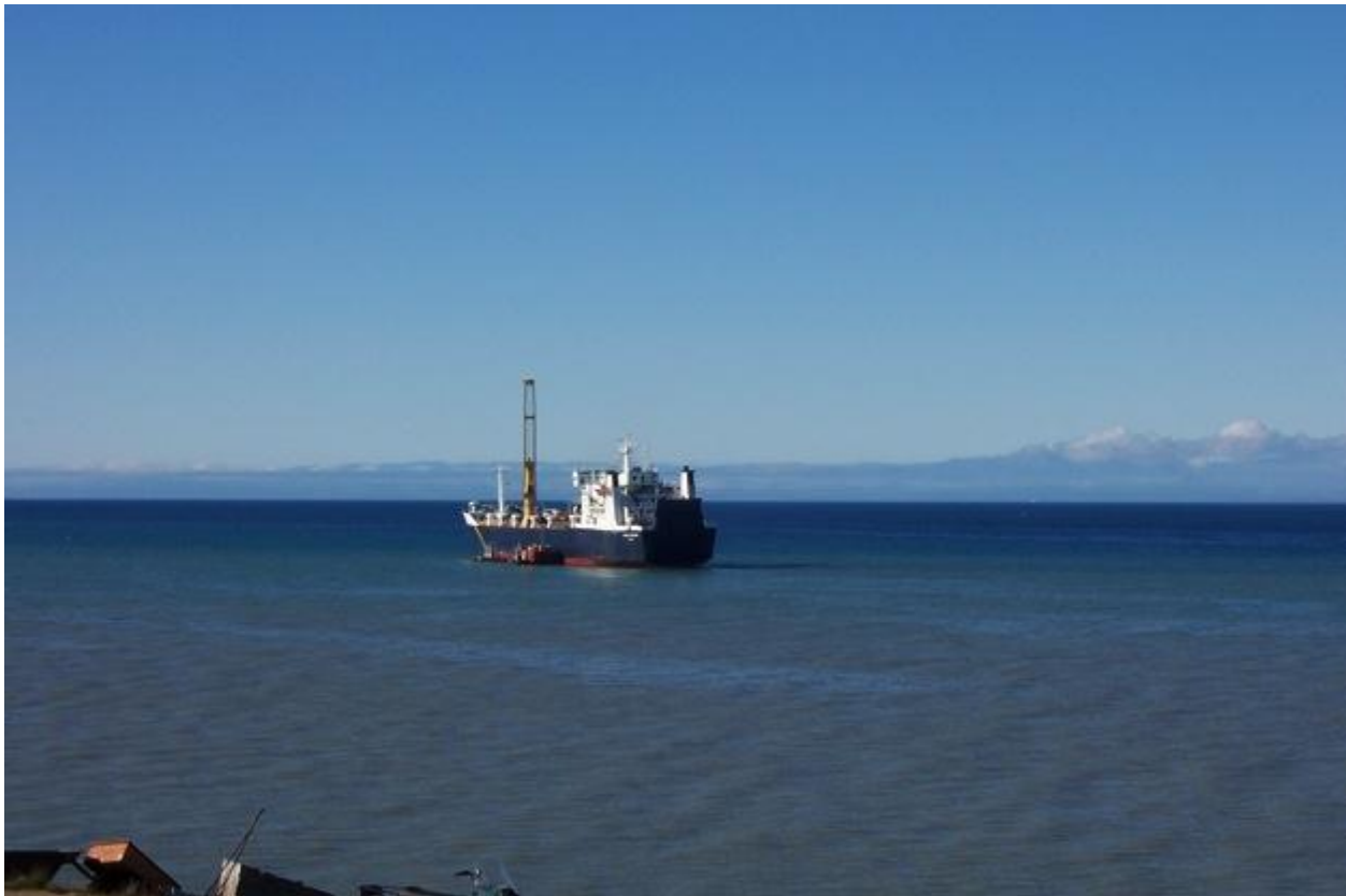
Plate 4.6: Sealift Delivering Semi-Annual Supplies to Pond Inlet

“If our population increases to two thousand in one year we do not have the housing to accommodate that. We do not have the recreational facilities to deal with that. We have an arena and we are building a new community center but there are going to be a lot of things that people are going to want like a swimming pool or a bowling alley. It will happen in time but it has been a hard fight with the feds and the GN to try to get infrastructure.” (Respondent 12)