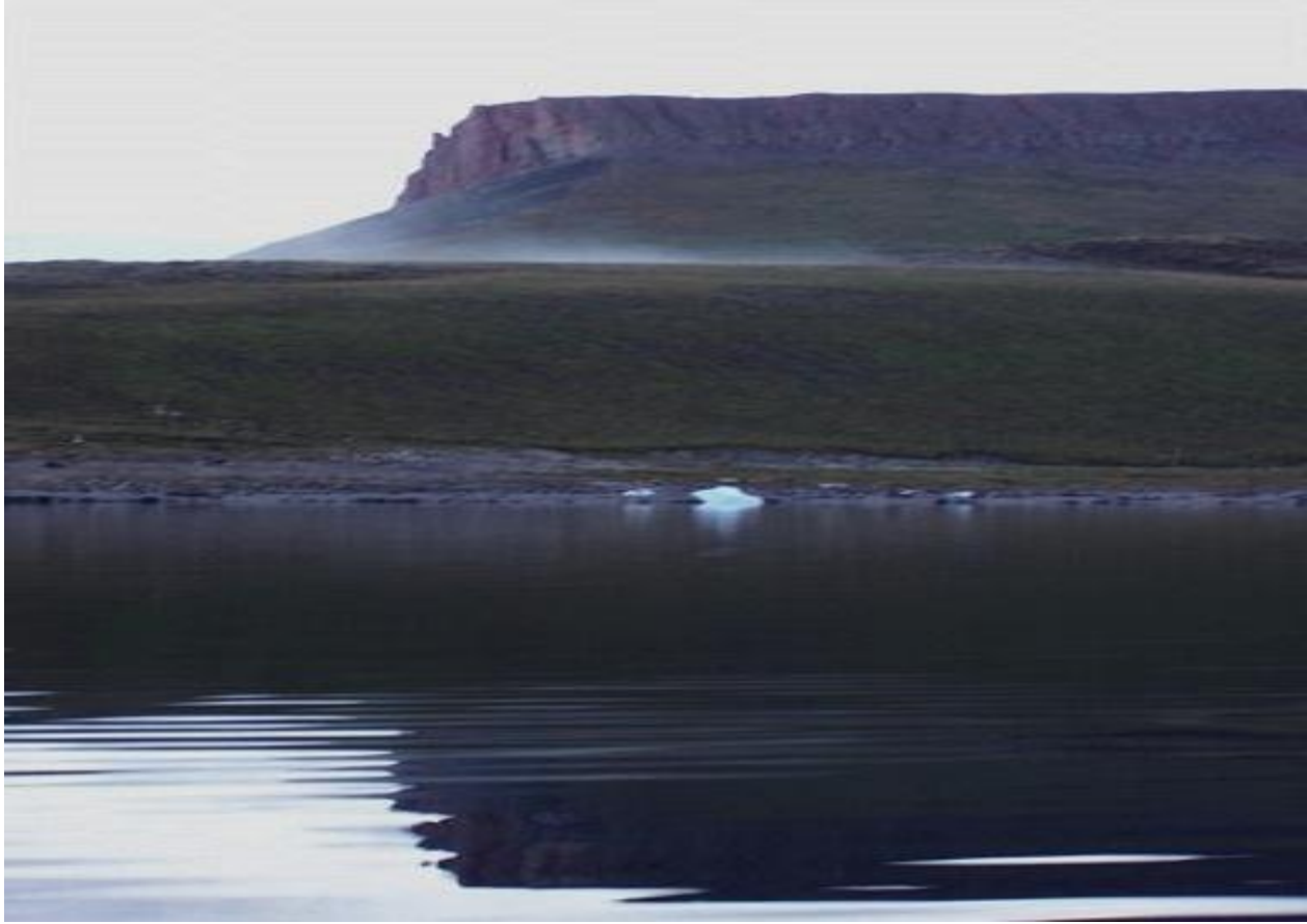
Plate 4.3: Arctic Vegetation from Shoreline to Mountain

Consequently, local concerns regarding increased erosion caused by wakes from ships indicate that effects are likely to vary between locations.