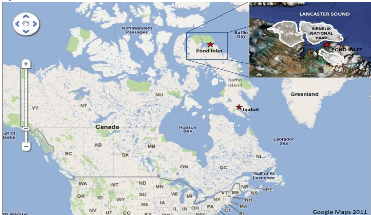
Figure 1.1: Location of Sirmilik National Park of Canada and Pond Inlet

Established in 2001, Sirmilik National Park of Canada is the most recent of the two Baffin Island parks and Canada's third largest national park, comprising 22,252km 2 (Parks 2009a). The Park is made up of four parcels on or around the northern tip of Baffin Island, and encompasses much of the Borden Peninsula, Bylot Island, Oliver Sound, and the Baillaraige Bay bird cliffs (see Figures 1.1 and 1.2). It also includes the Bylot Island Migratory Bird Sanctuary, which is jointly managed with the Canadian Wildlife Service. Sirmilik (meaning "place of glaciers") is 800km north of the Arctic Circle, and represents the Eastern Arctic Lowlands and Northern Davis Natural Regions of Canada, as well as parts of the Lancaster Sound Marine Region (Parks 2009a). The northern border of the park is formed by Lancaster Sound, which makes up the eastern entrance to the coveted Northwest Passage (see Figure 1.2).