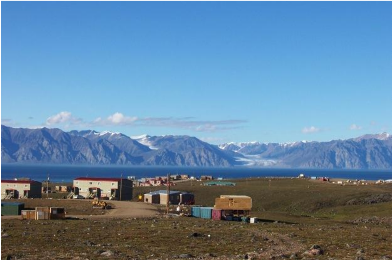
Plate 4.7: Pond Inlet with Bylot Island and Sirmilik Glacier in Background

Many respondents are wary of the trade-off of socio-cultural capital for economic development and are witnessing a shift in their culture. They suggested that we have to be careful when trading economic benefits (e.g., jobs, compensation, infrastructure) at the expense of the environment or traditional culture. While they are interested in improvements to quality of life, it is challenging to know if financial compensation for environmental or social degradation is fair, equitable, comparable, or equivalent.