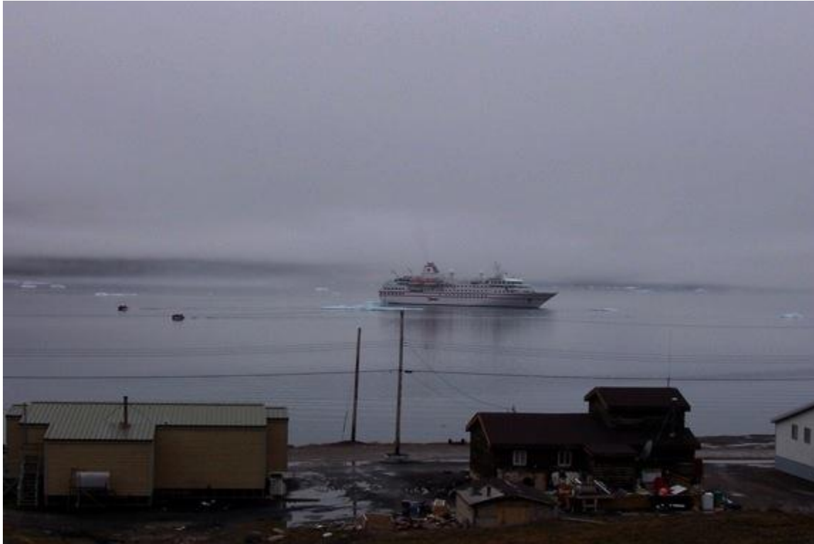
Plate 1.1: Hapag-Lloyd operated German cruise ship the Hanseatic anchored outside Pond Inlet

(Stewart 2008). Canadian arctic cruises peaked prior to the recession in 2008 with 22 separate trips, nine of which stopping in Pond Inlet and three landing at Sirmilik National Park (Stewart 2008). Stewart (2008) argues that if the global economy can sustain it, the Arctic may experience an explosion of cruise tourism that must be undertaken safely and sustainably in these remote, pristine, and hazardous environments.