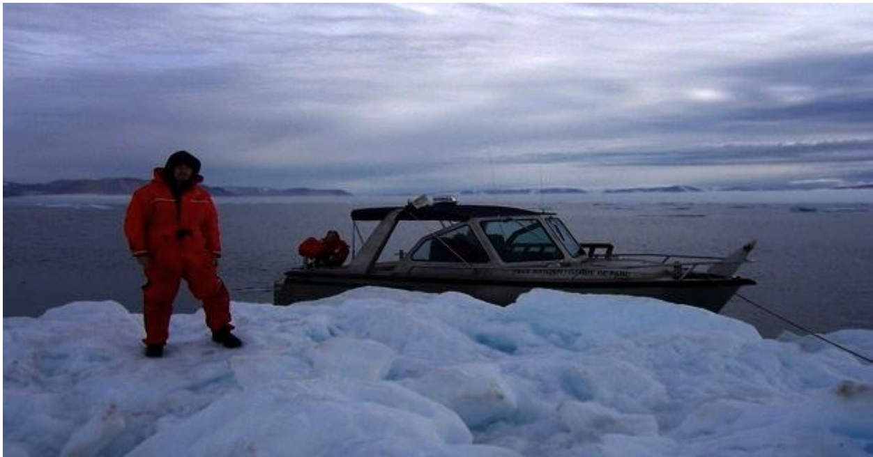
Plate 4.11: Parks Canada Patrol Vessel Refueling in Navy Board Inlet

Having the presence of monitors in the Arctic can provide some additional benefits that were not directly identified in interviews but came up in casual conversation: the mere presence of more local people would help to reduce the number of violations of the Park rules; local residents are a critical way to support Canada’s claim for sovereignty based on occupation of the North; more local residents on ships can help to provide education to visitors about interesting natural areas or cultural attributes.