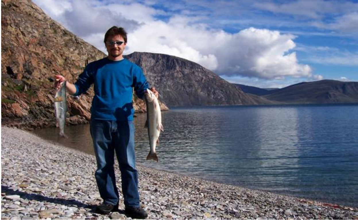
Plate 4.1: Glistening Arctic Char from the Pristine Arctic Waters and Incredible Scenery

Two individuals I spoke to remarked on the potential for tourists to come by ship for this incomparable fishing experience.