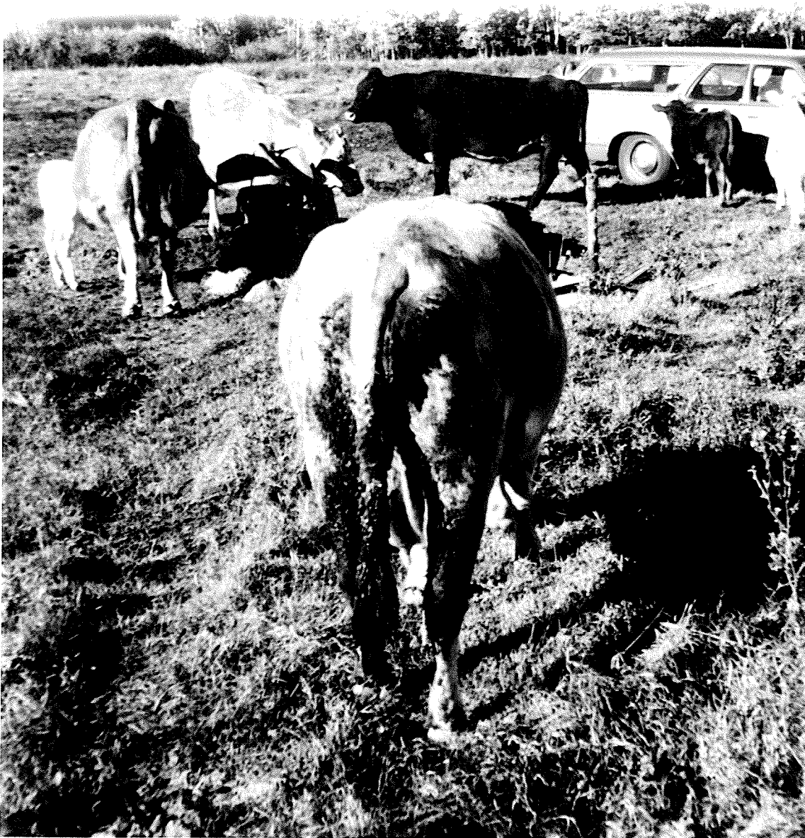
FIGURE 5. A cow demonstrating severe scouring associated with molybdenum induced copper deficiency.