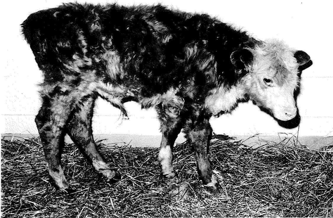
FIGURE 4. A 3 month old calf demonstrating signs of severe copper deficiency. Note the rough hair coat, enlarged leg joints, stiffness in the hind legs and general unthriftiness.