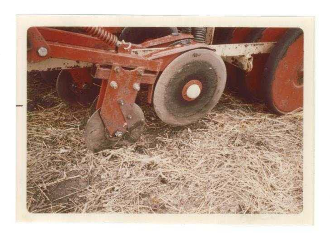
Figure 3.1 Triple disc drill assembly.

Seeding was accomplished using a modified Kirschmann double-disc press drill. The drill was equipped with semipneumatic packer wheels and heavy duty pressure springs. For zero tillage plots a cutting disc 26 cm in diameter was attached to improve penetration. Figure 3.1 indicates the triple disc arrangement. For flax and rapeseed, it