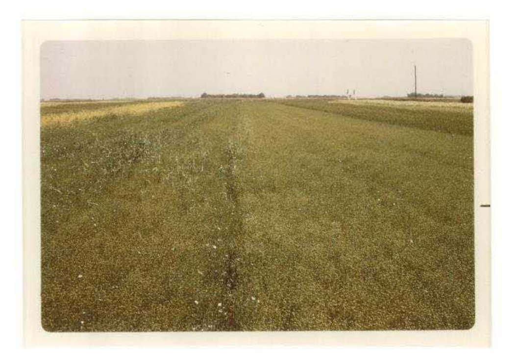
Figure 4.1 Flax at Portage indicating differences in wild oat population in 1971. Left - cultivated; Right - zero tillage.

and broad-leaved weeds were reduced under zero tillage. Three years of zero tillage were sufficient to have a relatively consistent influence on the weed population.