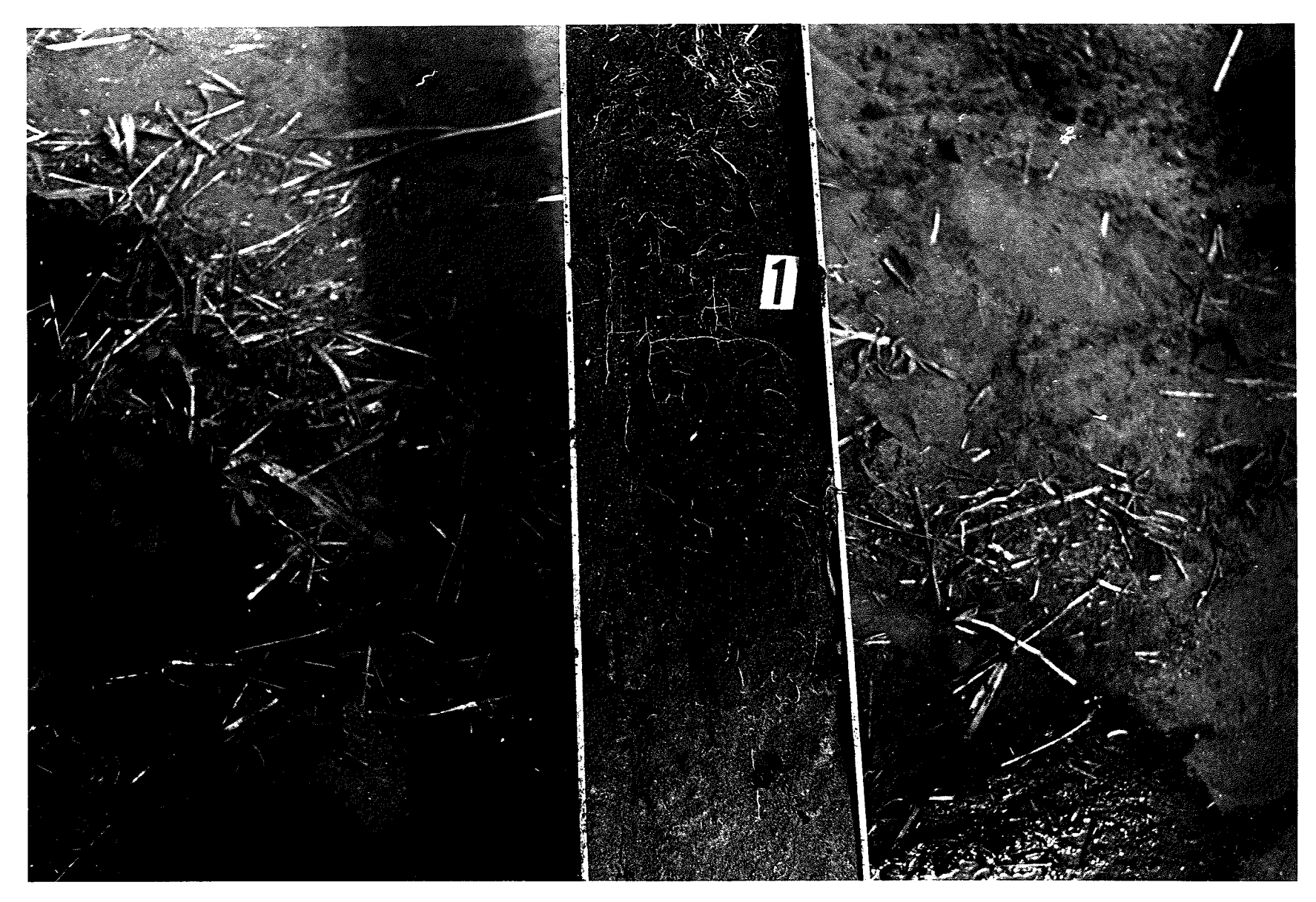
Figure 4.3 Tap root of a rapeseed plant in a soil core taken from a cultivated treatment plot at Portage.