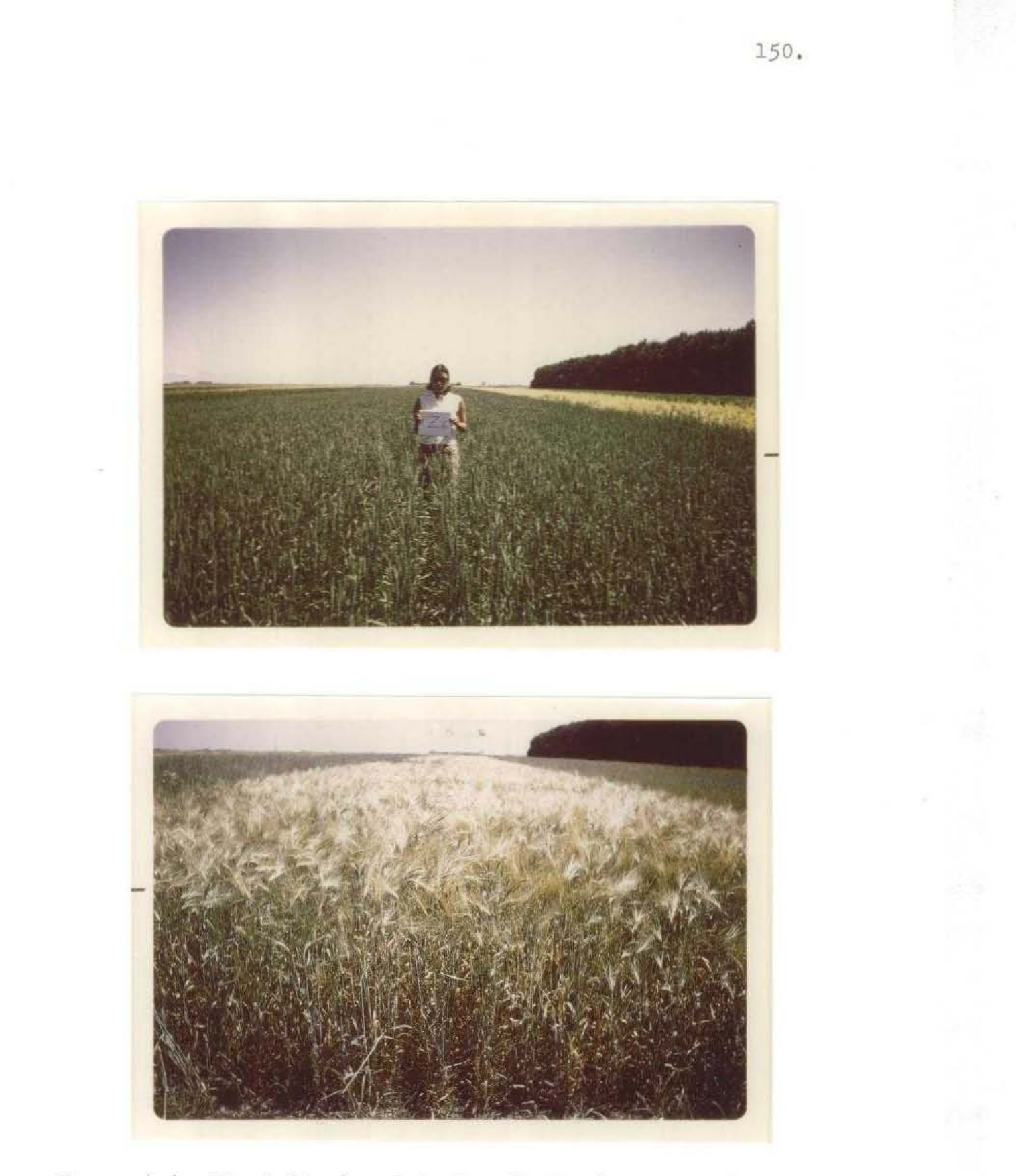
Figure 4.4 Wheat (top) and barley (bottom) grown under zero tillage at Portage, 1970.