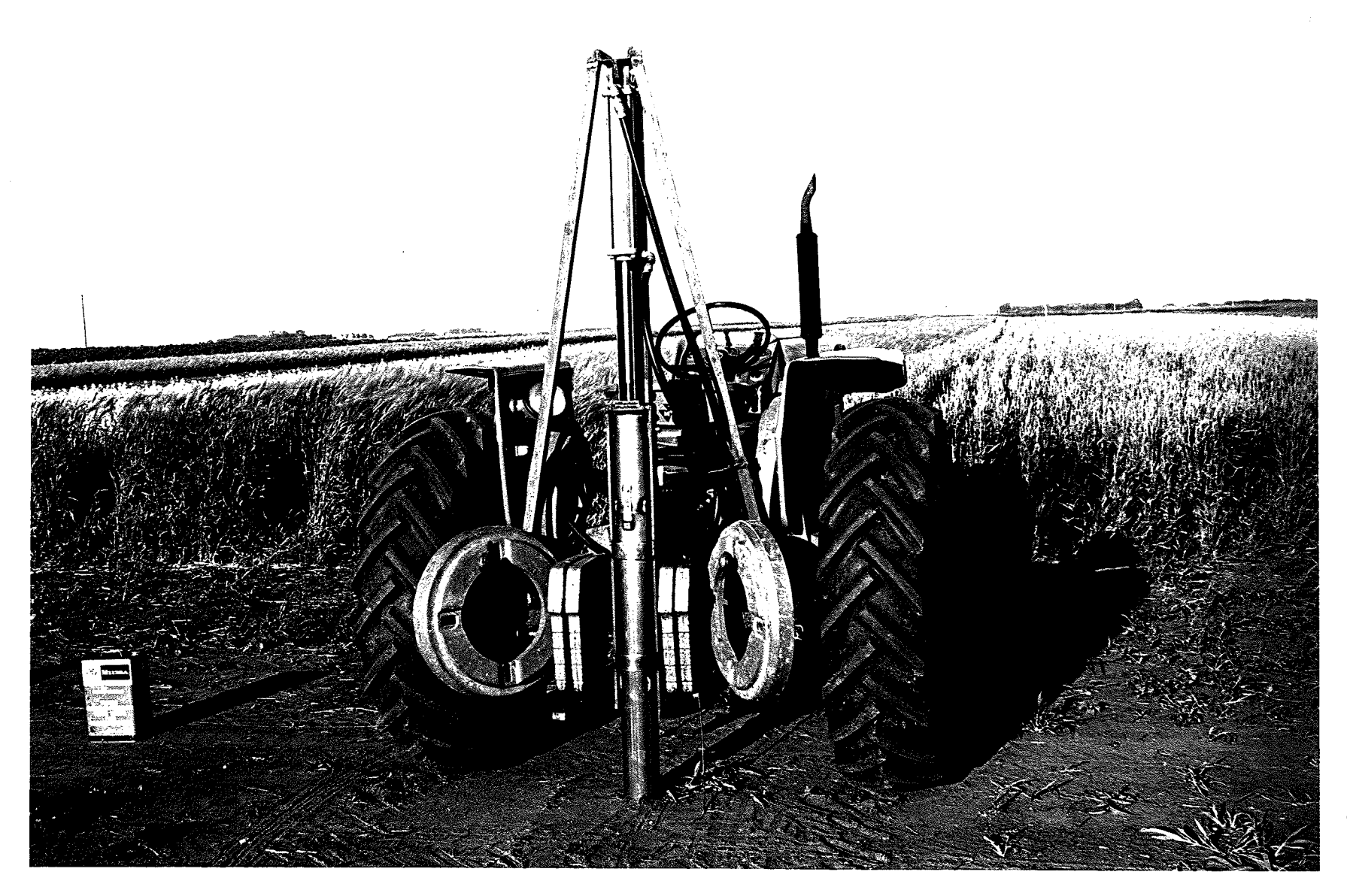
Figure 3.2 Soil come sampler.