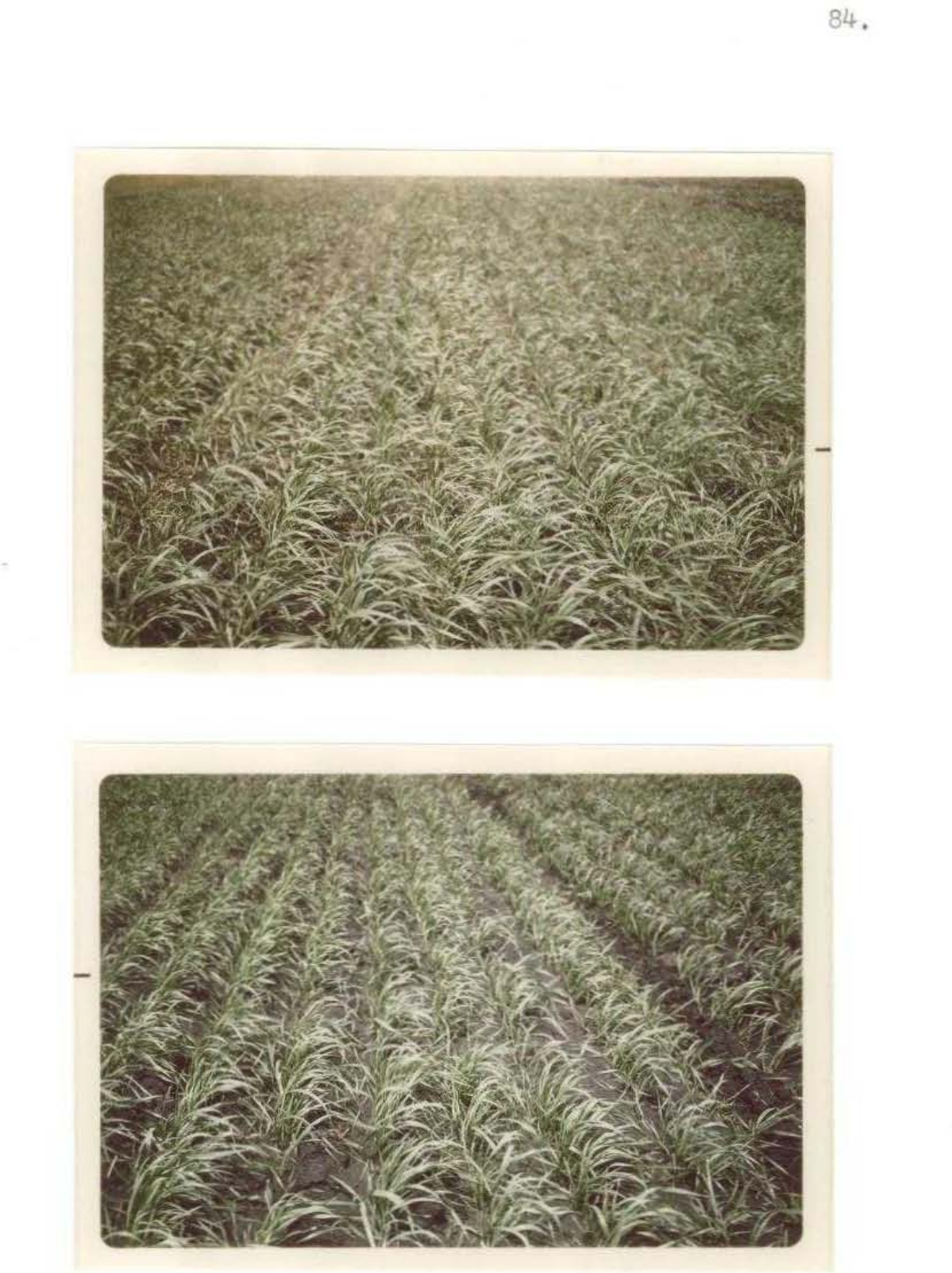
Figure 4.2 Zero tillage (upper) and conventional tillage (lower) wheat four weeks after seeding.