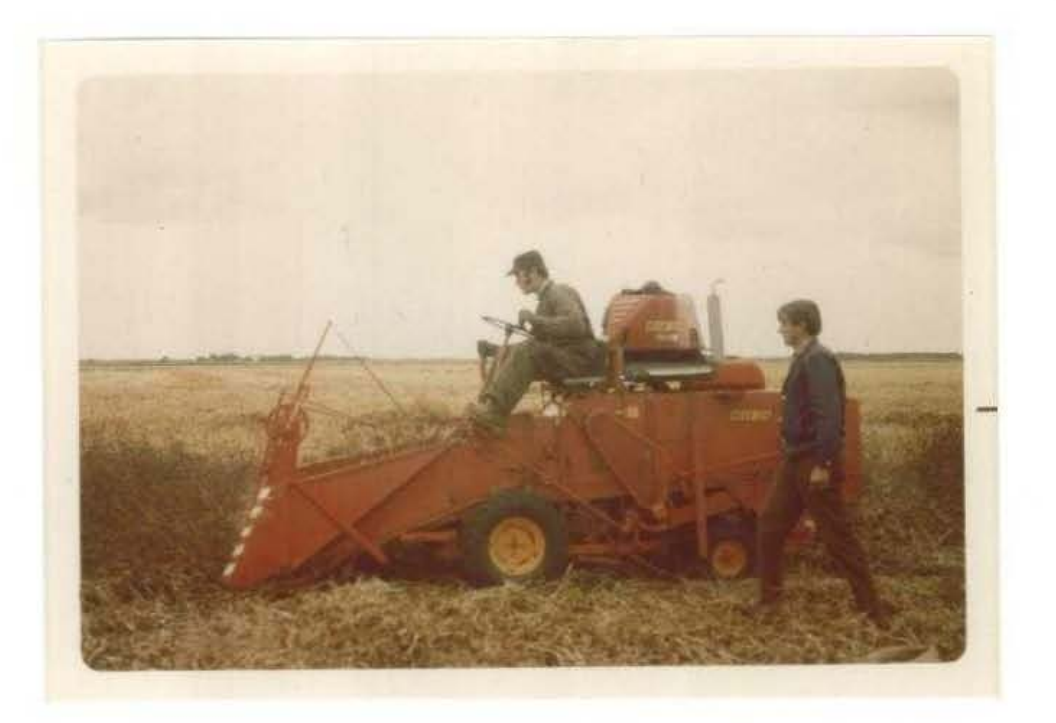
Figure 3.4 Hege 125 plot combine.

Yield data was obtained by harvesting samples from plots. Harvest techniques varied considerably. Appendix C-2 indicates sample size and method of harvesting. In 1970 and 1971, a Hege 125 plot combine was used to harvest most samples (Figure 3.4). Data was not obtained for