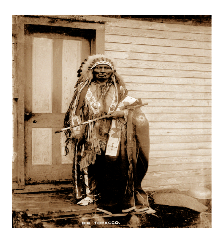
Illustration 1. "Big Tobacco" Dance Hall Chief circa 1900 (U.S. Geological Survey Department of the Interior, 2010).

The photo of Dance Hall Chief "Big Tobacco" (circa 1900) shown in Illustration 1 is a typical depiction of the significant role that tobacco has had in the lives of many Aboriginal people (in this case American Indian).