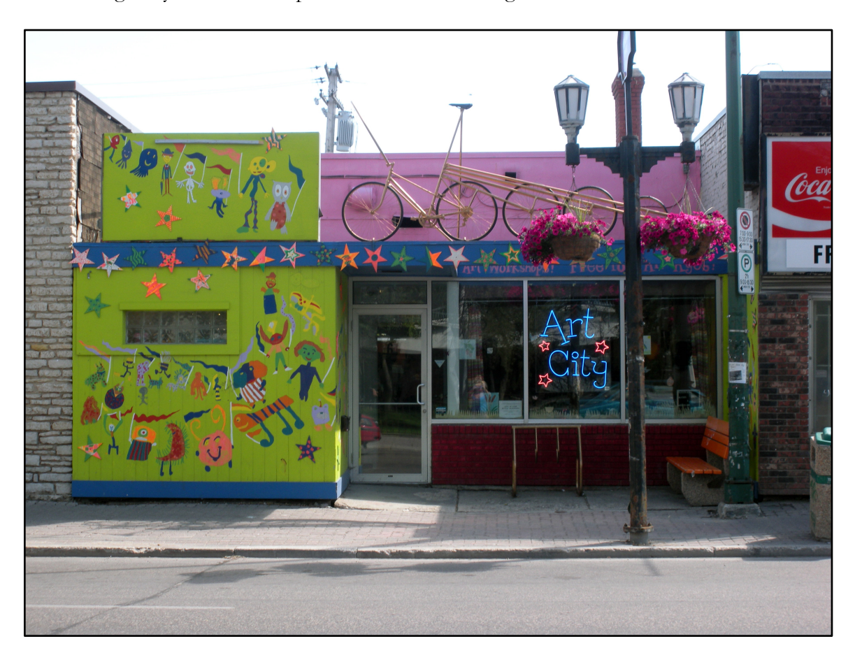
Figure 3 - Art City (Art City, 2010)

Art City (Figure 3) operates out of a storefront on Broadway Avenue / Trans Canada Highway in between Spence Street and Young Street.