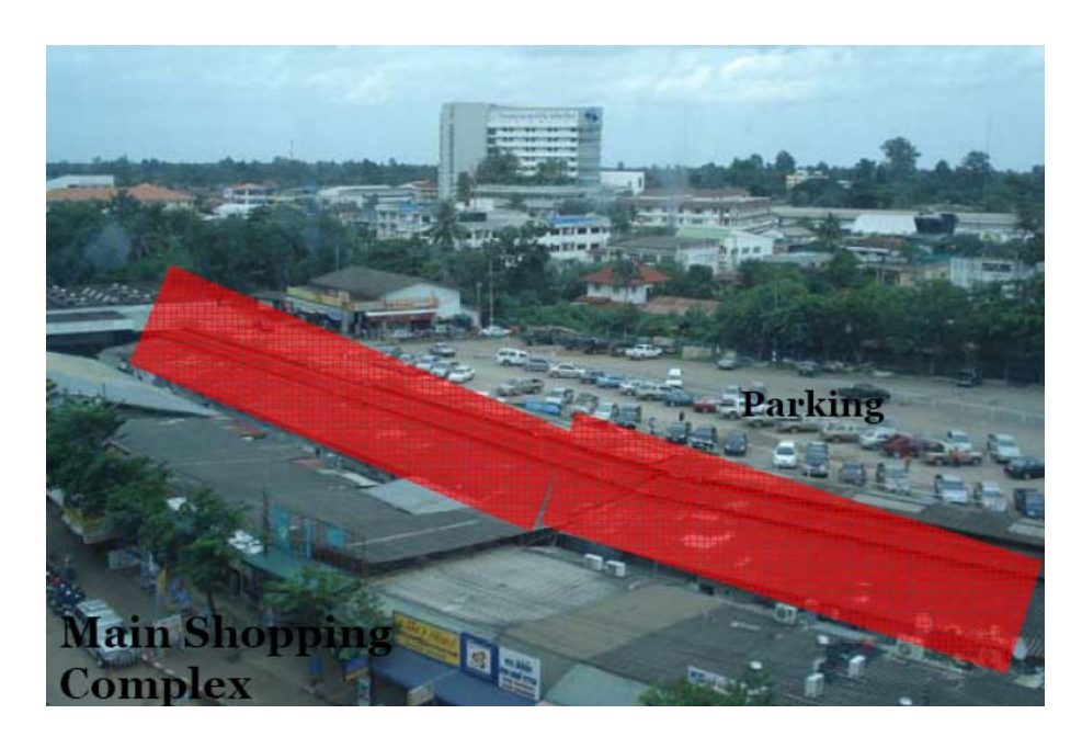
Figure 6: This photo is taken from the fourth storey of the main shopping complex. The main group of expat bars (Soi Pattaya) is located under the red shading. Though Soi Pattaya is not directly visible from the street anyone using the main shopping complexes auxiliary parking lot will walk through the bars.

Around half of this group of bars is managed by expats while the other half is Thai managed.