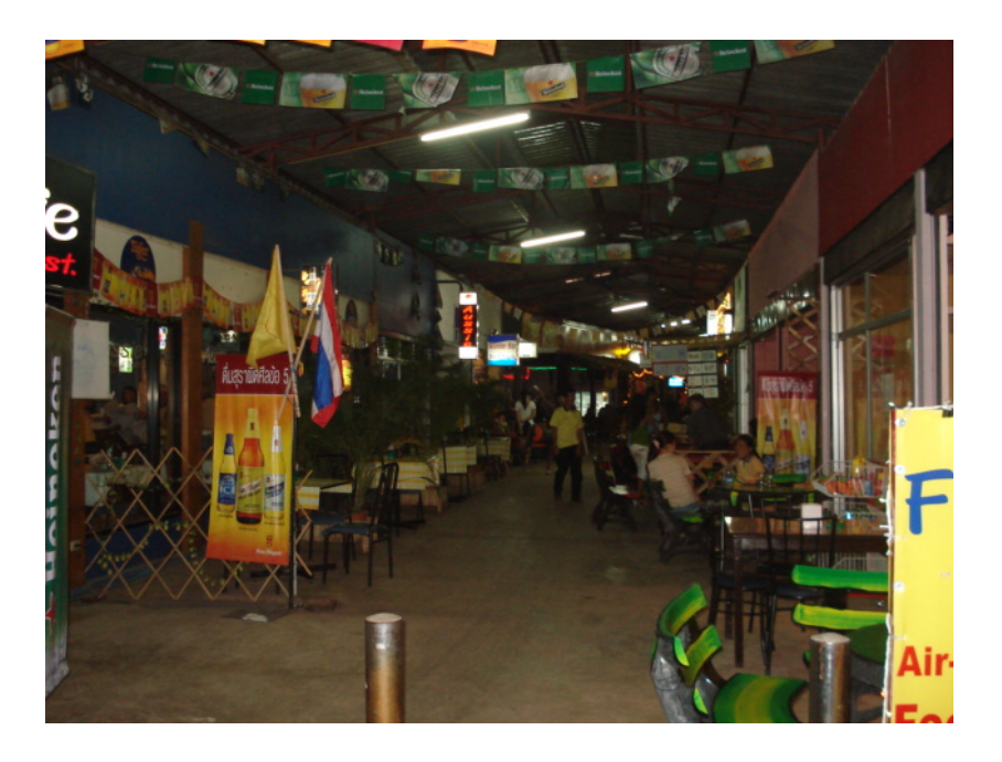
Figure 3: Soi Pattaya is a group of 13 bars located in the center of Udon Thani.

The group of bars is unintentionally hidden from the view of the main roads and is found through a series of alleys. The bars are housed in an old market which is in the process of redevelopment with several sections getting torn down over the past few years to provide parking for the main shopping centre. There is consistent talk about the future of these bars as the land is slated for development.