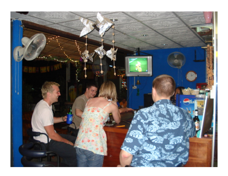
Figure 4: A standard Udon Thani bar. The younger clientele is not representative as older men are the typical clientele.