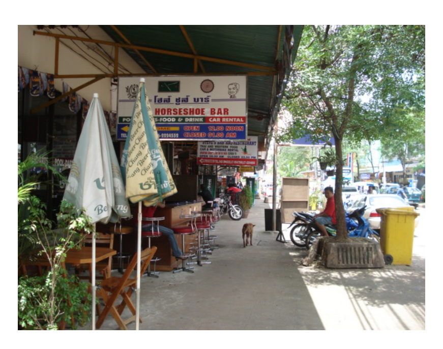
Figure 7: Foreigner bars are located throughout town and are clustering in small groups.

There is a clustering of a few bars on Prajak Road, many of these bars follow the same formula with a combination of Thai and western food, bar girls, cheap drinks, music and occasionally a pool table.