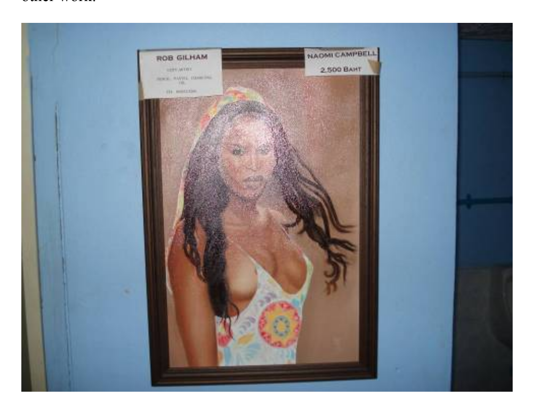
Figure 9: The only local expat artist's displayed art was on display in the bathroom of the Down Under Bar.

No artists were met in Udon Thani. The only art seen that was displayed by a foreigner was for sale at one of the bars (see figure 10) which was indicative of the artists other work.